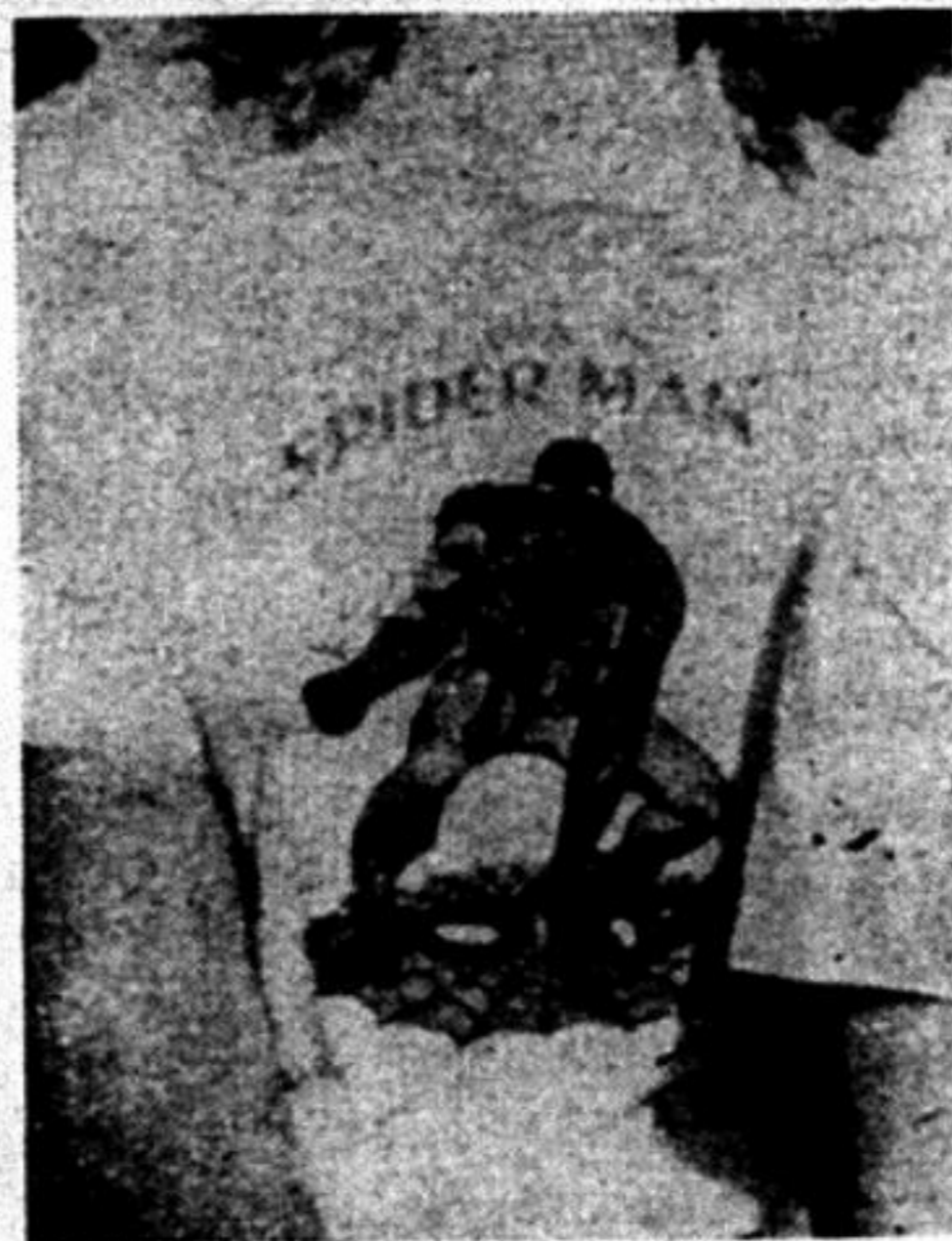
SPIDERMAN... This is what you put on your sweatshirt to celebrate Beethoven's birthday.