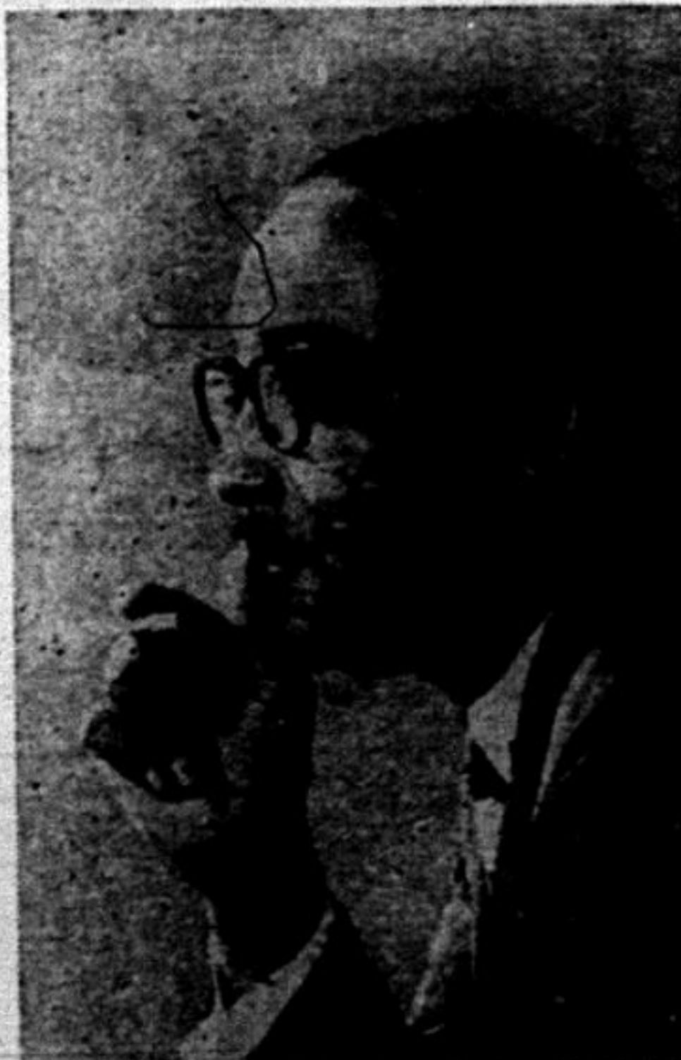
LOUIS LOMAX Negro Author

Lomax now has his own weekly television show in Los Angeles on Sunday evenings.