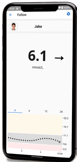
Dexcom Follow app on the Follower's smart phone