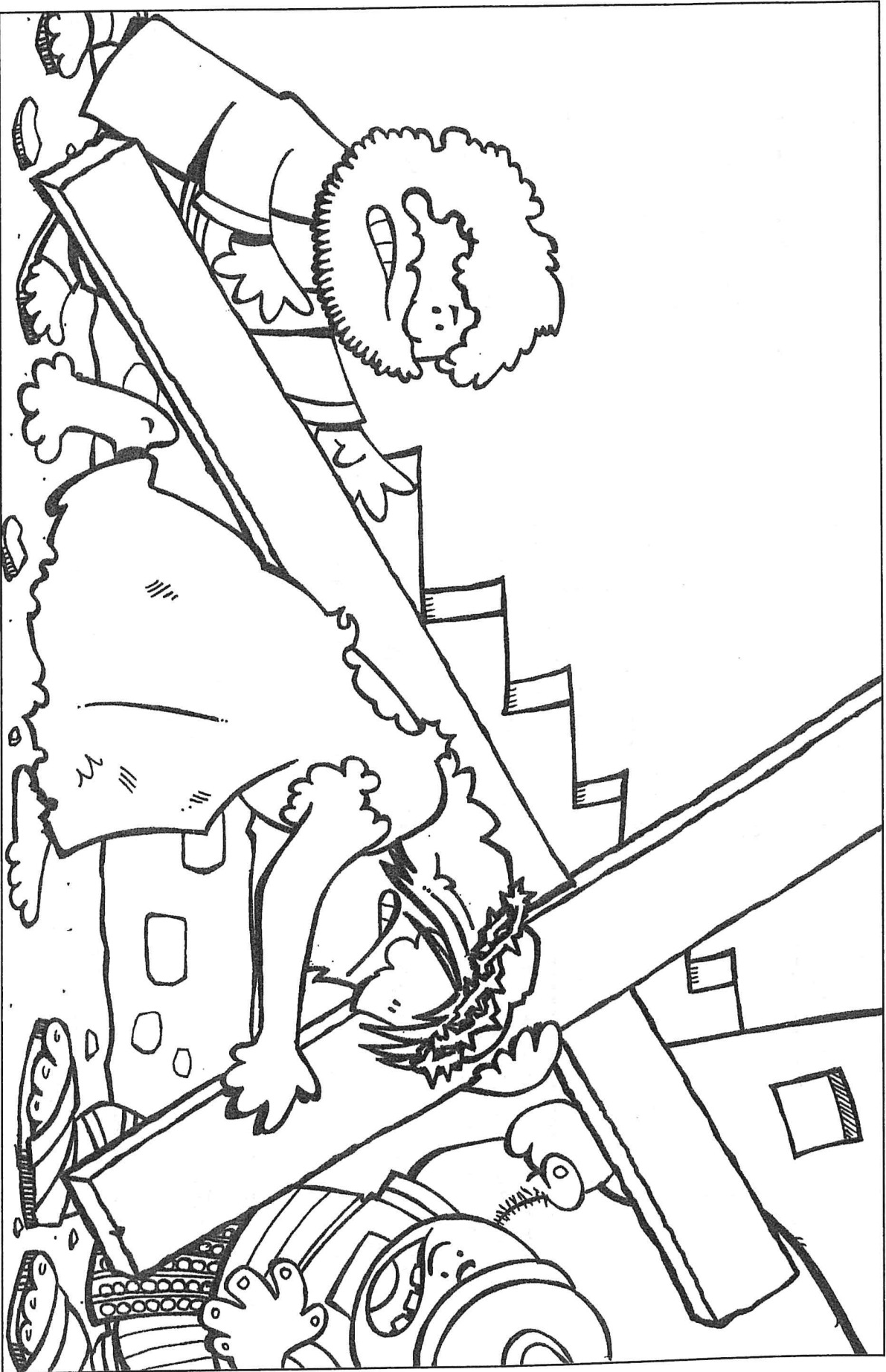
The soldiers made Jesus carry a heavy wooden cross. The cross was too heavy for him.