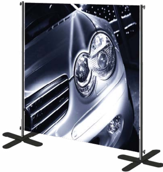
Conversion kit base stands.