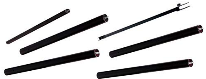
Poles for conversion kit.