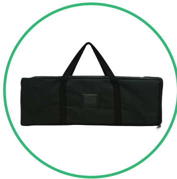
QTY 1: Black Nylon Carry Bag