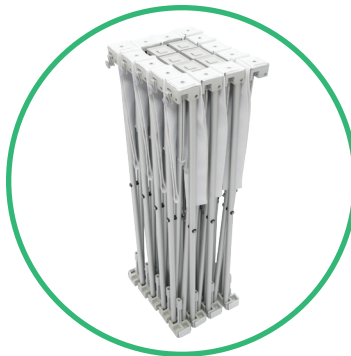
QTY 1: Frame w/ Pre-Installed Graphic