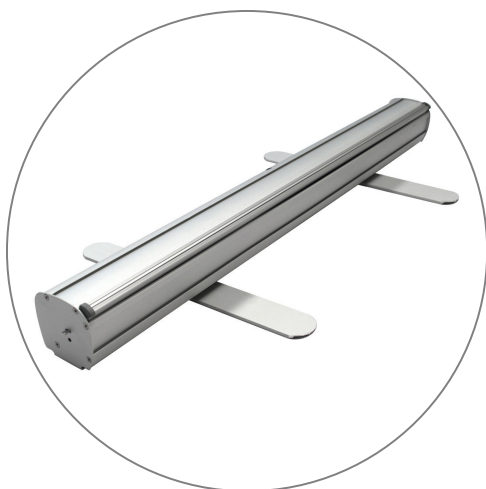
(QTY 1): Good Roll Up Stand