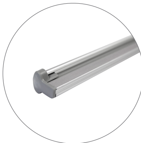
(QTY 1): Clamp Bar