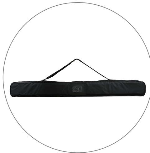
(QTY 1): Travel Bag