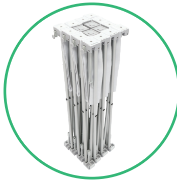
QTY 1: Frame w/ Pre-Installed Graphic

• 9 1/4" L x 10 3/4" W x 31 1/4" H (Collapse Frame)