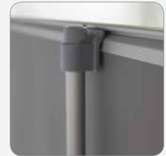
9. Slide graphic up. Latch onto top of pole and reinsert pin into base to secure graphic.