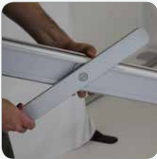
7. Slide feet out from base.