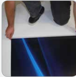
2. Remove end pieces and place to sides. Slide graphic into top bar.