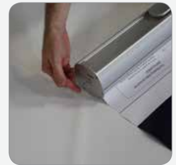
6. Press graphic on firmly. Remove pin on side of base and slowly let the graphic slide into base.