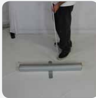
8. Insert pole into base.