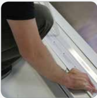
4. Remove tape cover from base.