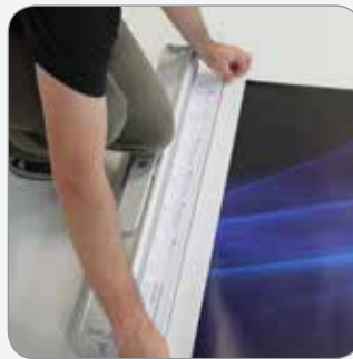
5. Slide graphic bleed edge to match the line below the base adhesive tape.