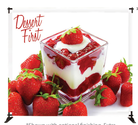
*Shown with optional finishing. Extra pole pockets added to left and right sides of graphic.