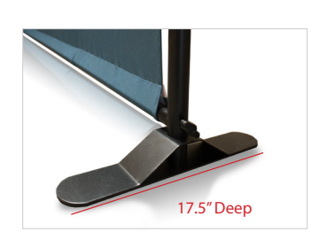
Sturdy Steel "Bridge" Support Base.

Graphic Turnaround Time is 2 business days for up to 2 sets