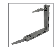
Vail Tool Free Corner Connector (QTY: 4)