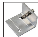
*Wall Mounts (Qty: 4)