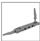
*Vail Tool Free Split Connector