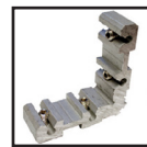
Vail Corner Connector (Qty: 4)