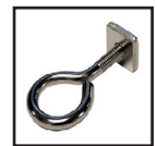
*Ceiling Eye Hook