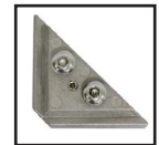
Triangle Lock (Qty: 4)