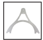
Yeti Feet (Qty: 2)