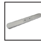
Vail Feet (Qty: 2)