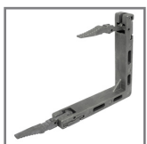
Vail Tool Free Corner Connector (QTY: 4)