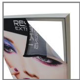
*Vail Tool Free Split Connector