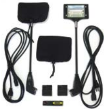
*Optional 150 watt halogen lights