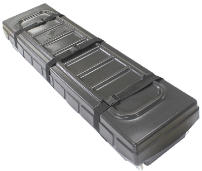
La Caja Case