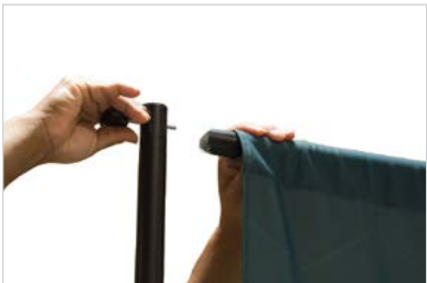
Clutch lock offers secure horizontal and vertical adjustments.