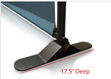
Sturdy Steel "Bridge" Support Base.

Graphic Turnaround Time is 2 business days for up to 2 sets