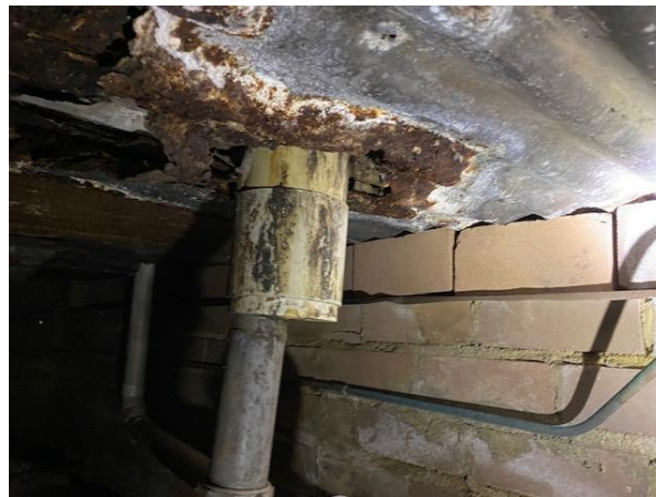
Leaking shower floor waste in subfloor