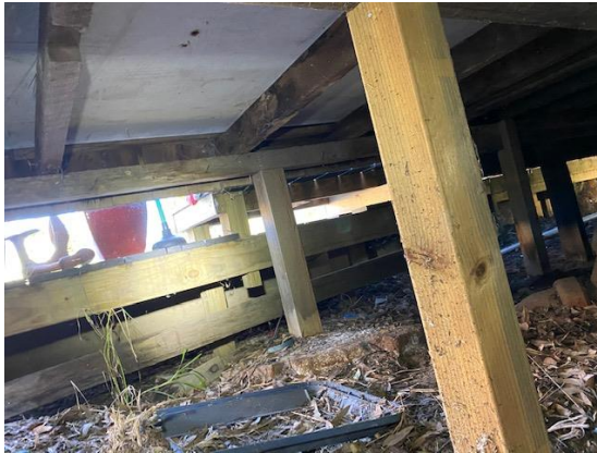
Timber piers in ground contact