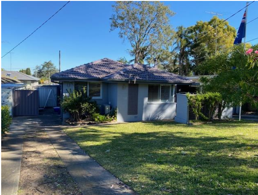
11 Selkirk Street, Winston Hills NSW 2153

Account to: Bay Property Inspections Vendor Name: - Phone: 0409 185 988 Vendor Contact No: - Client: Bay Property Inspections Invoice No: 8434