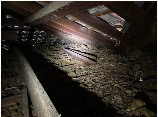
Insulation in roof void restriction inspection