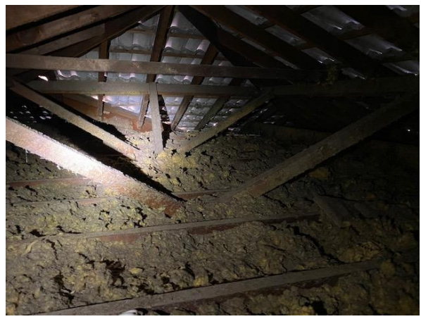
Insulation in roof void restriction inspection