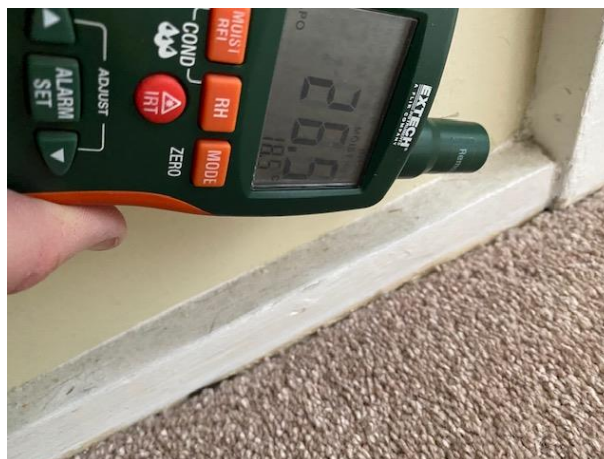
26.5% moisture detected behind shower recess

5.4 At the time of the inspection elevated moisture readings were detected at a reading of 26.5% in the wall behind the main shower recess.