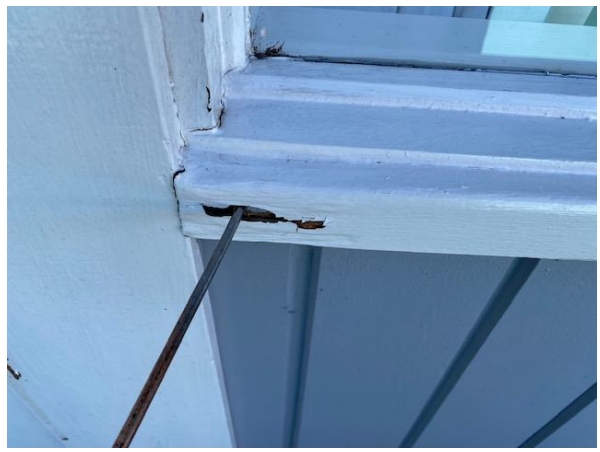
Wood rot in windowsill