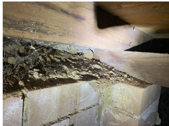
Timber Bearers in ground contact – inadequate termite protection