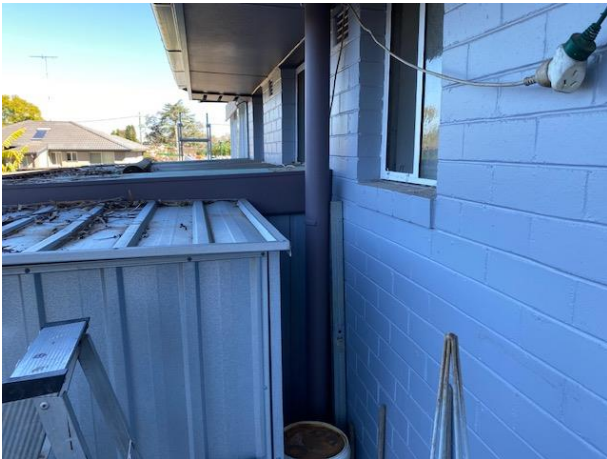
No inspection of the wall was possible behind the shed

1.3 Other Area(s)* to which REASONABLE ACCESS for Inspection was NOT AVAILABLE and the Reason(s) why include: The edge of the concrete slab due to infill slab construction. The roof void because of the flat roof construction at the rear of the property. The shed due to stored goods being present.