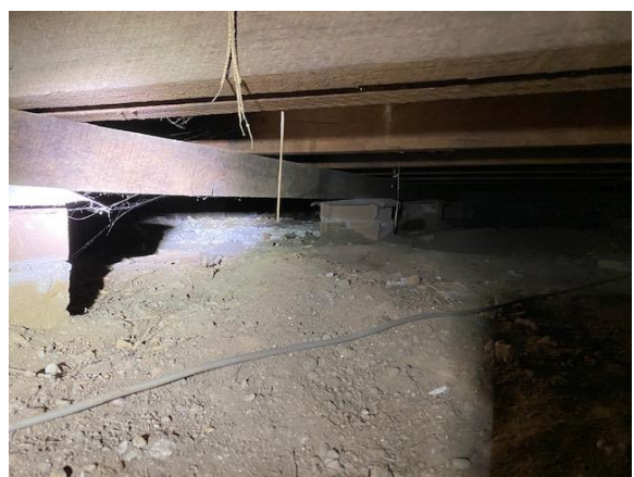
Limited inspection due to height of subfloor