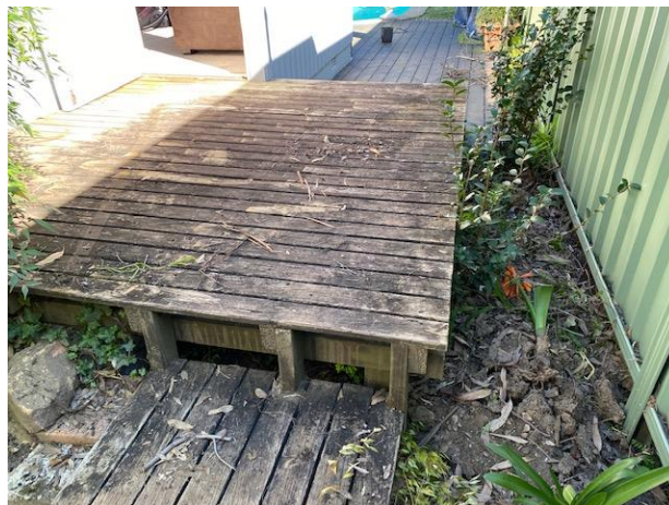
No access below deck for inspection

1.4 Area(s) in which Visual Inspection was Obstructed or Restricted and the Reason(s) why include: The interior due to cavity walls, lined walls, stored items, and floor coverings obstructing inspection. The Roof void due to insulation being present and truss design restricting inspection. The subfloor because of limited access below and around the pool decking.