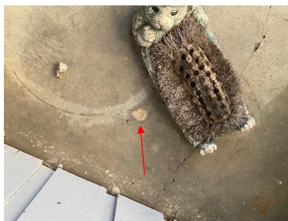
Drill holes in front veranda indicating possible previous termite treatment