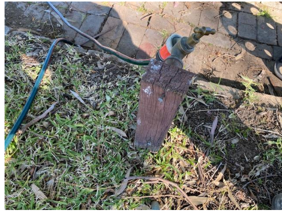
Timber tap post should be removed & replaced