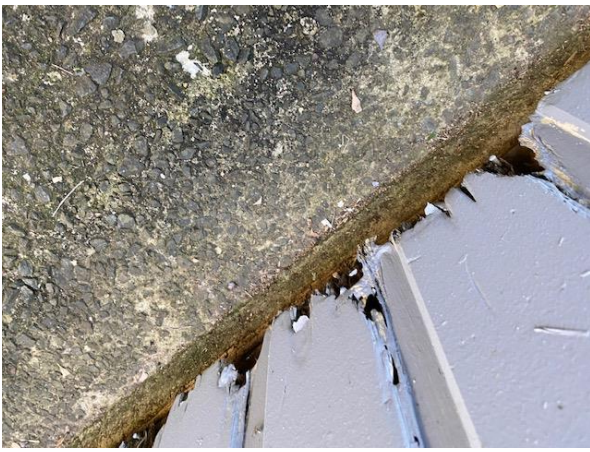
Wood rot in timber cladding