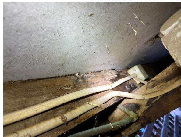
Leaking laundry tub below laundry in subfloor

We claim no expertise in building and if any leaks were reported then you must have a plumber or other building expert determine the full extent of damage and the estimated cost of repairs.