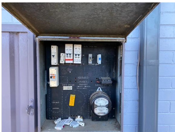
No durable notice present in the meter box

2.6 Durable Notice (Termite Management Notice) A durable notice was not located and there was no evidence suggesting it may have been removed.