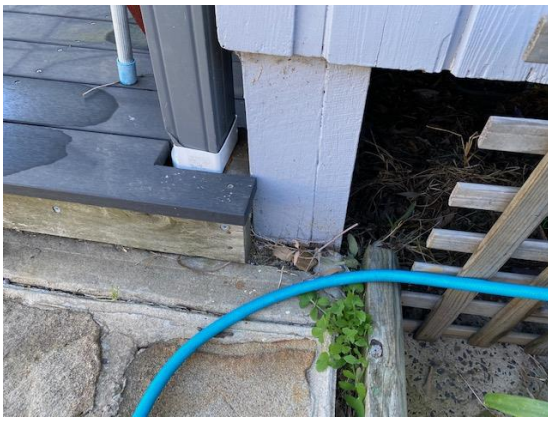
Timber piers in ground contact