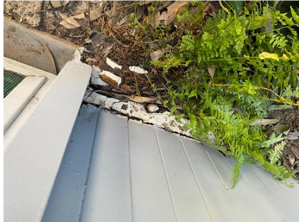
Wood rot present in carport timbers and around the property