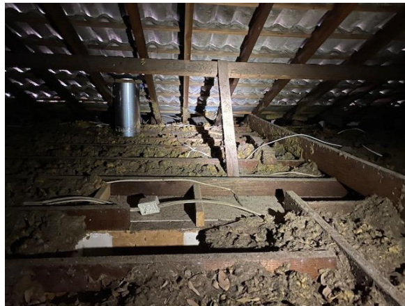
Insulation in roof void restriction inspection