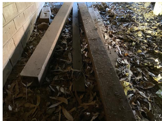
Loose timber in subfloor should be removed