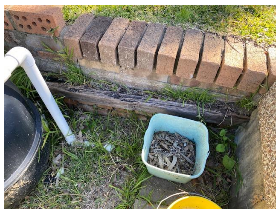
Landscaping timbers should be removed