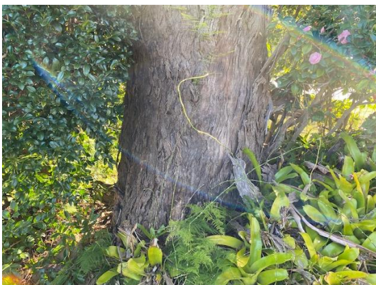
Tree should be drilled and inspected (front yard)

Landscaping Timbers: Should be removed and replaced with a non-susceptible material.