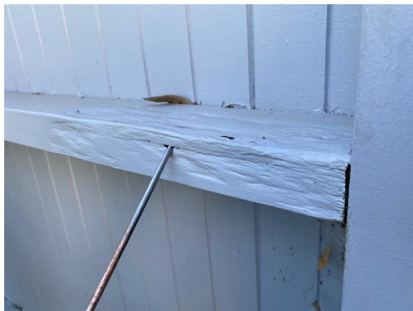
Wood rot present around the property

Where damage is reported above, does its presence represent a major safety hazard? No.