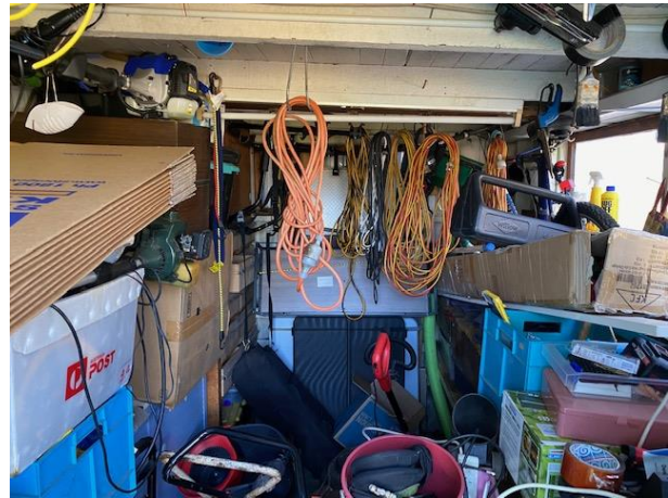
Stored items in the shed obstructed inspection

1.4 Area(s) in which Visual Inspection was Obstructed or Restricted and the Reason(s) why include: The interior due to cavity walls, lined walls, stored items, and floor coverings obstructing inspection. The Roof void due to insulation being present and truss design restricting inspection. The subfloor because of limited access below and around the pool decking.