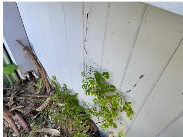
Wood rot present in carport timbers and around the property