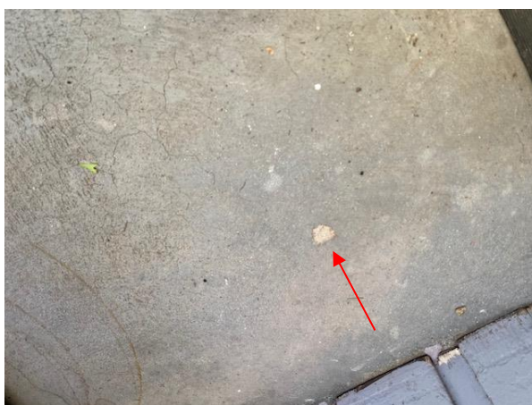
Drill holes in front veranda indicating possible previous termite treatment

WARNING: If evidence of drill holes in concrete or brickwork or other signs of a possible previous treatment are reported then the treatment was probably carried out because of an active termite attack. Extensive structural damage may exist in concealed areas. You should have an invasive inspection carried out and have a builder determine the full extent of any damage and the estimated cost of repairs as the damage may only be found when wall linings etc are removed.