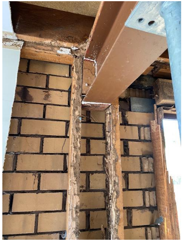
Previous Termite Damage at the time of Inspection.