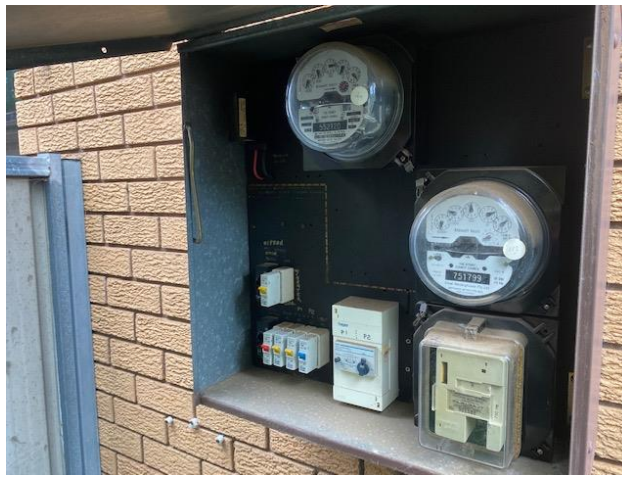
No Durable Notice was located in the meter box

This firm can give no assurances with regard to work that may have been previously performed by other firms. You should obtain copies of all paperwork and make your own inquiries as to the quality of the treatment, when it was carried out and warranty information. In most cases you should arrange for a treatment in accord with "Australian Standard 3660" be carried out to reduce the risk of further attack.