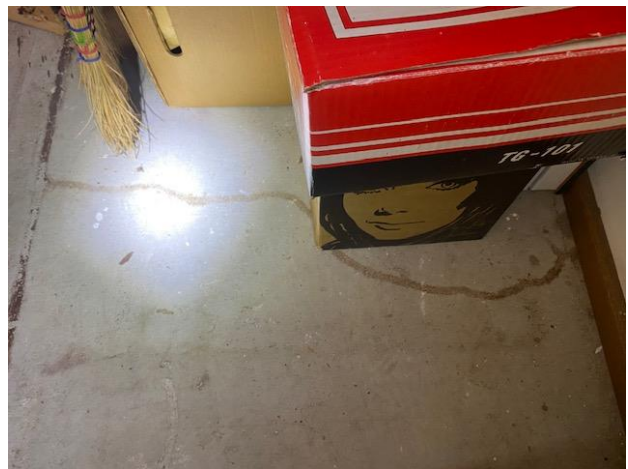
Termite Lead located in the garage

NOTE: Where evidence of termite activity was found in the grounds then the risk to buildings is very high. A treatment to eradicate the termites and to protect the building(s) should be carried out. Where the evidence of termite workings was found in the grounds or the building(s) then the risk of a further attack is very high.