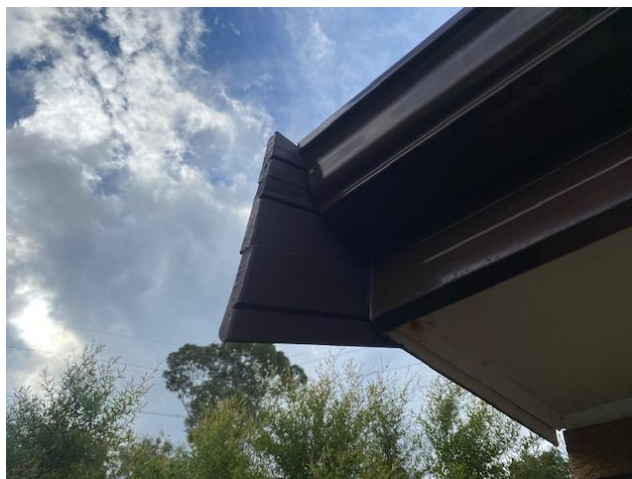
Minor wood rot located to barge board timber

4.1 Was evidence of wood decay fungi (wood rot) found? Yes, Localised minor wood rot located to barge board timber.