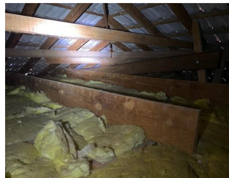
Insulation in roof void obstructing inspection zone