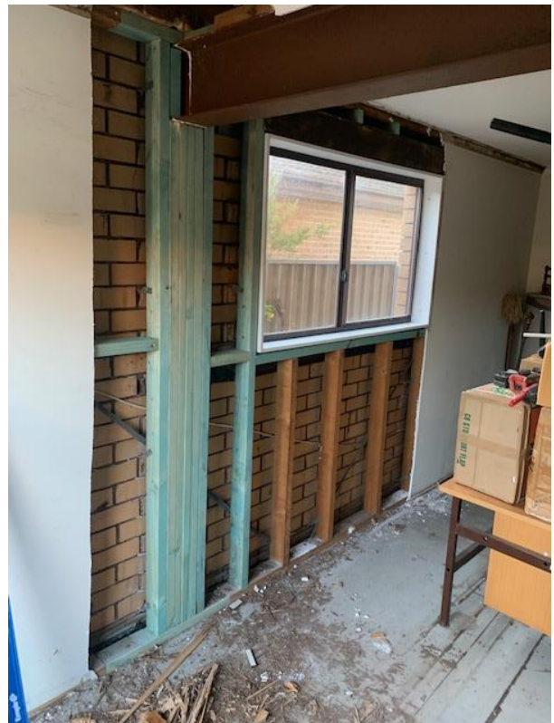
Rectified Termite Damage as at 14 th April 2021