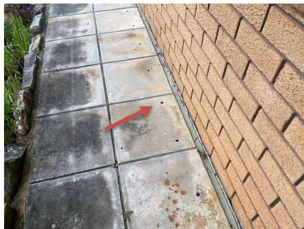
Drill holes located to the perimeter of the house

WARNING: If evidence of drill holes in concrete or brickwork or other signs of a possible previous treatment are reported then the treatment was probably carried out because of an active termite attack. Extensive structural damage may exist in concealed areas. You should have an invasive inspection carried out and have a builder determine the full extent of any damage and the estimated cost of repairs as the damage may only be found when wall linings etc are removed.