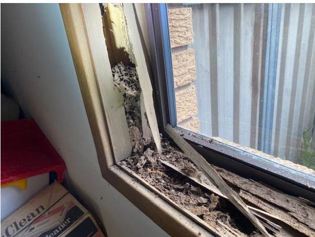
Termite damage located to garage windowsill

2.3 Extensive visible evidence of subterranean termite workings and/or damage was found located in the garage windowsill and a termite lead was found to the garage floor.