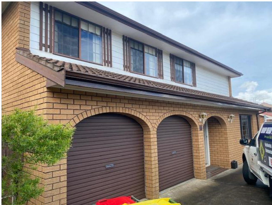
14 Torumba Close, Bangor NSW 2234

Account to: Bay Property Inspections Vendor Name: Jean Moss Phone: - Vendor Contact No: - Client Name: Jean Moss Invoice No: 15336