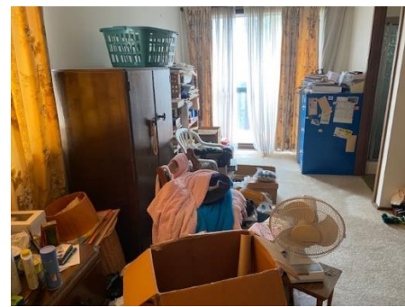
Stored items obstructing inspection zone

1.5 High Risk Area(s) to which Access should be gained, or fully gained, since they may show evidence of Timber Pests or damage include: The Roof void which is obstructed by insulation. The garage which is obstructed by stored items.