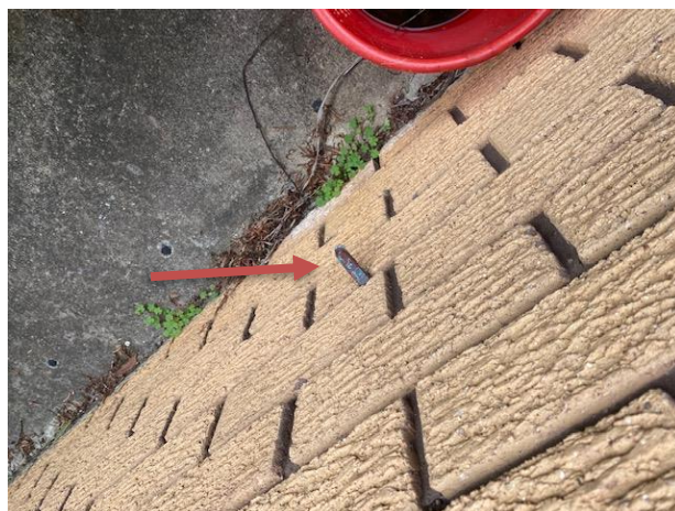
Hot water service overflow pipe should be piped away to a drain or downpipe

5.2 Is there a need for this work to be carried out? Yes, redirect the hot water service overflow pipe to a drain or downpipe