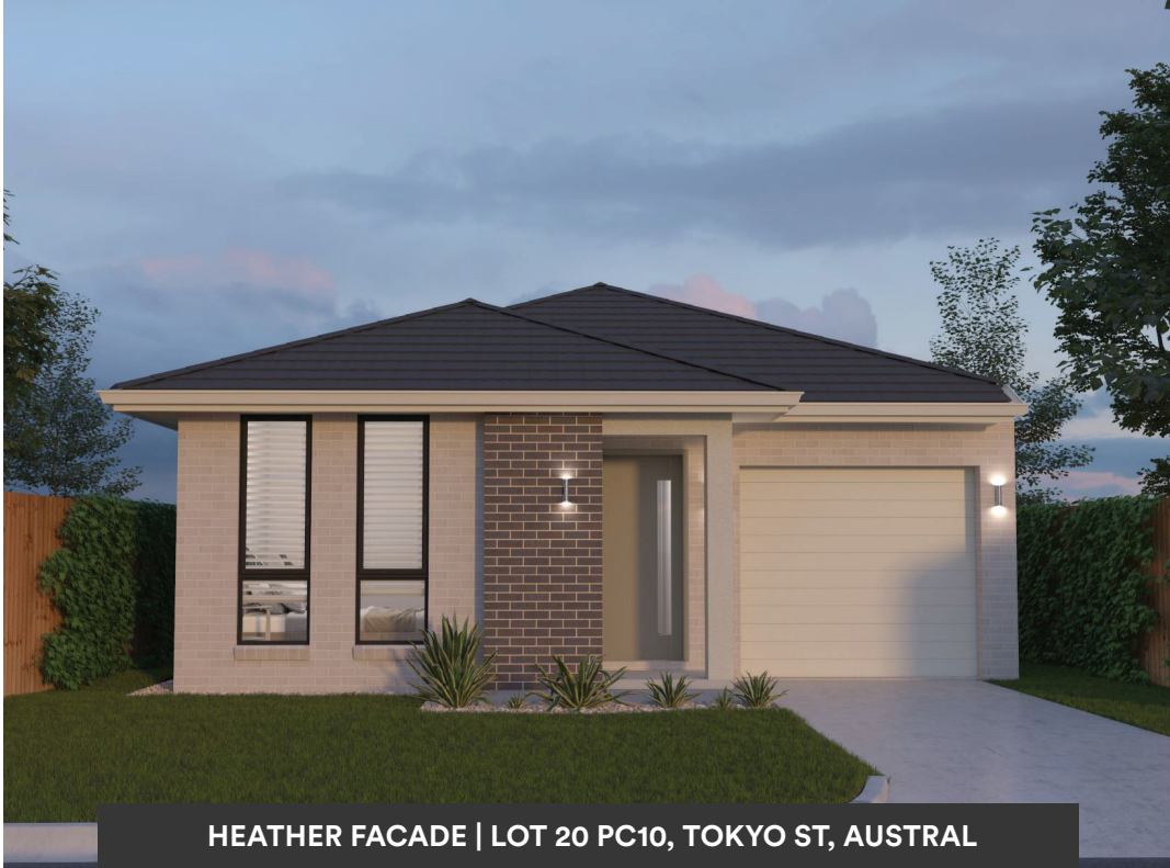
HEATHER FACADE | LOT 20 PC10, TOKYO ST, AUSTRAL