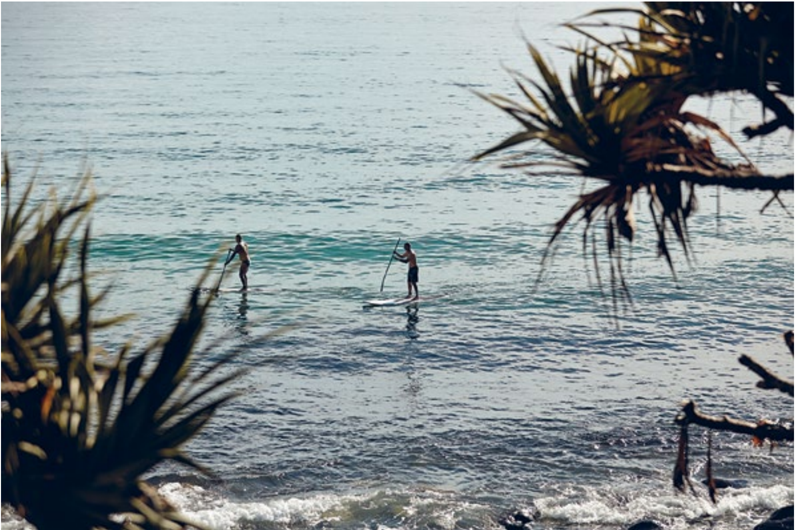
STAND-UP PADDLE BOARDING AT BURLEIGH