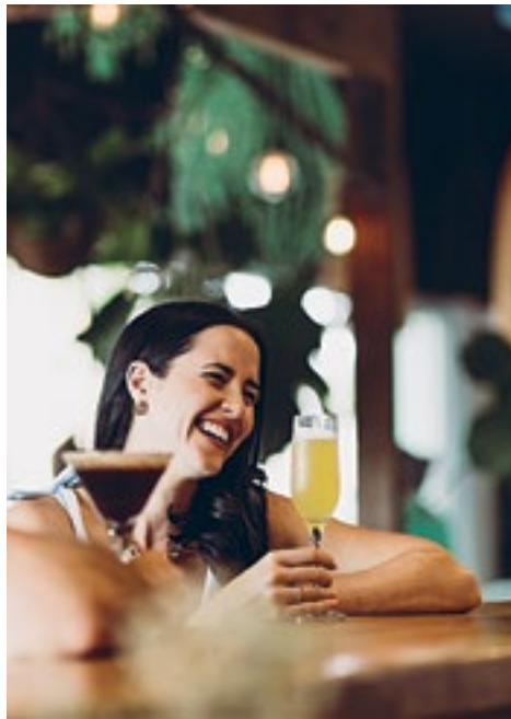
COCKTAILS AT LITTLE MERMAID