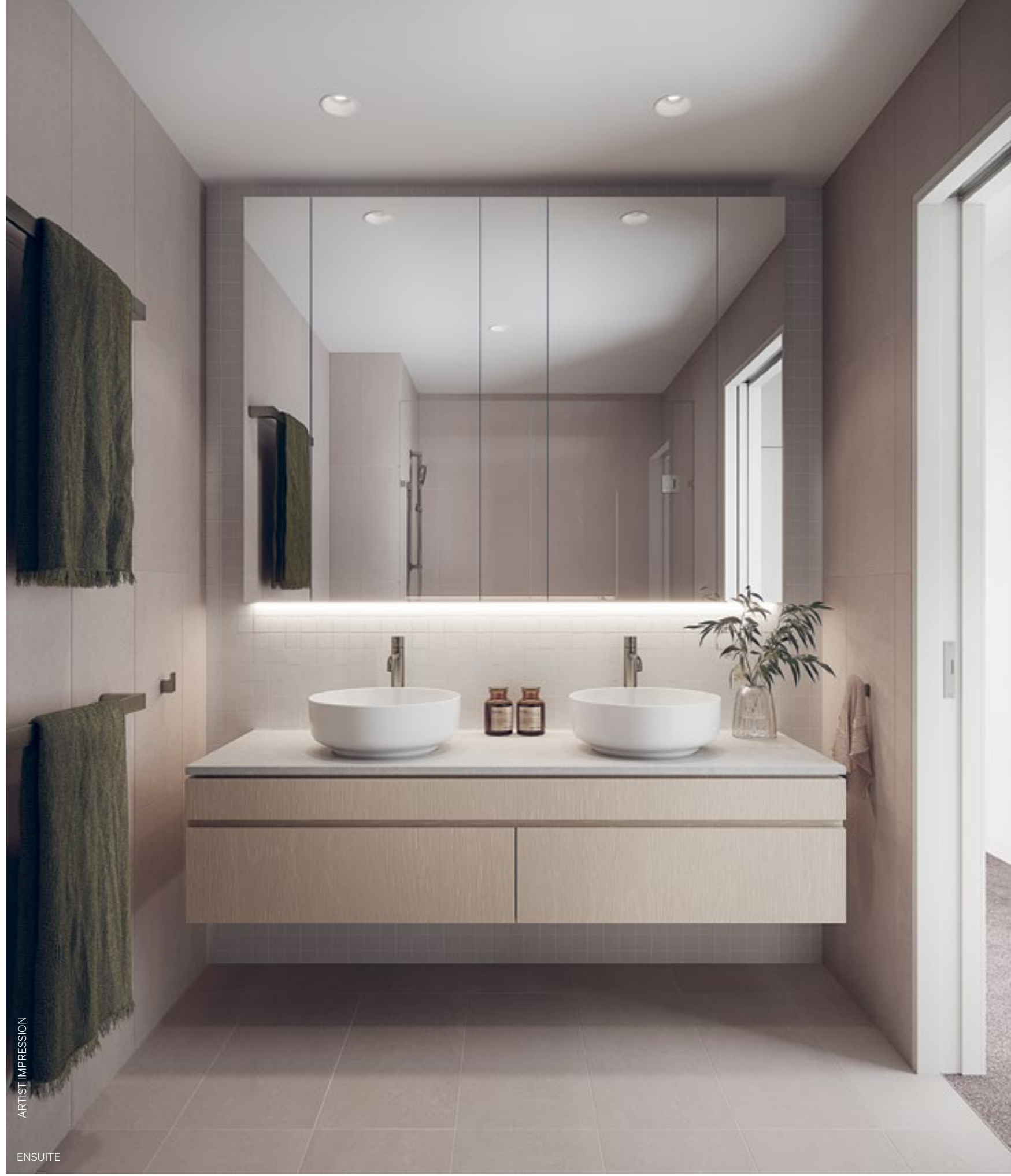
ARTIST IMPRESSION ENSUITE