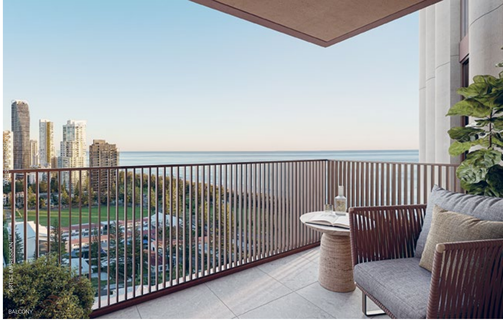
ARTIST IMPRESSION BALCONY