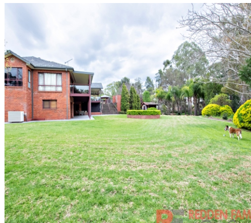
PLENTY OF ROOM TO PLAY