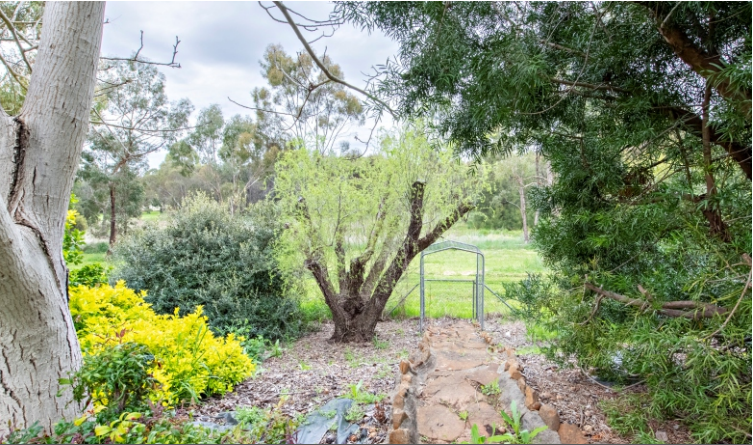
ACCESS TO TROY CREEK