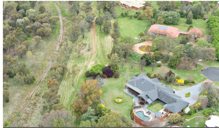
TROY CREEK AT YOUR BACK GATE