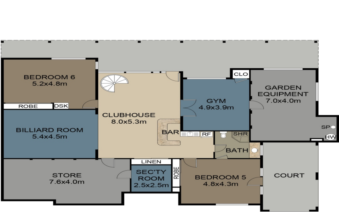
DOWN STAIRS FLOOR PLAN