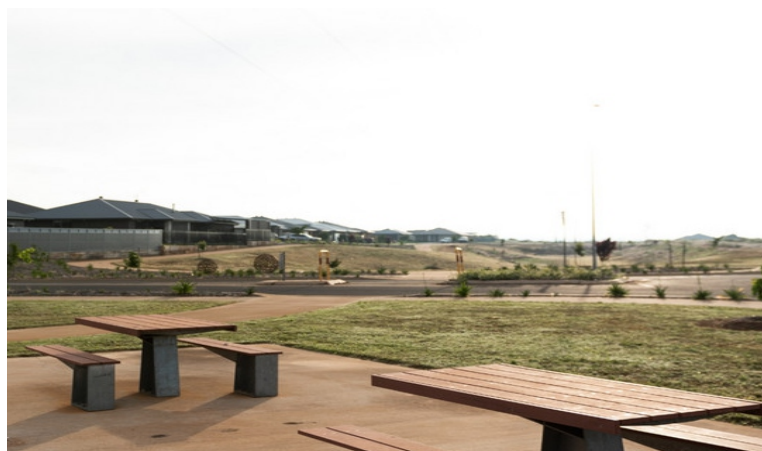
LANDSCAPED COMMUNITY SPACES