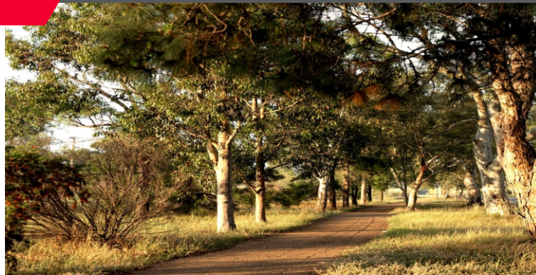
RIVER WALKWAYS CONNECTIVITY