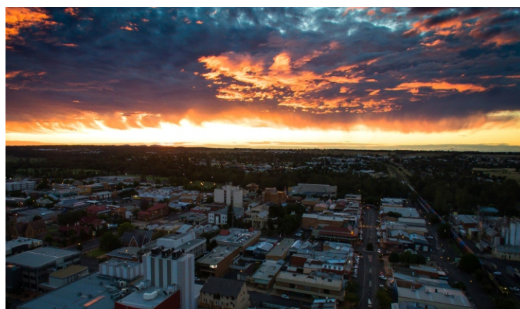
5 MINUTES TO CBD

Redden Family Real Estate recommend you obtain the following: Independent legal advice, Unconditional finance, Pest & building inspections