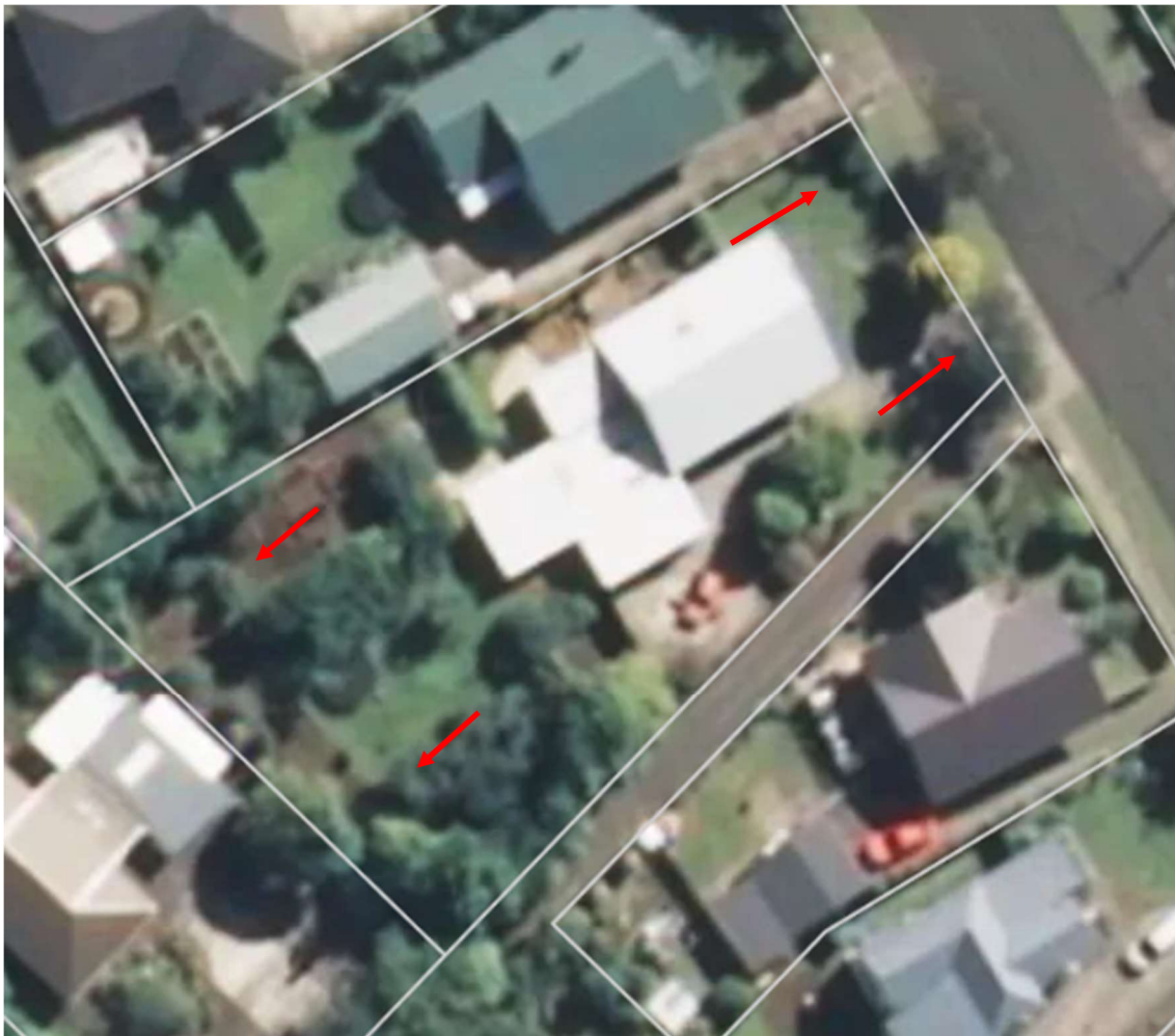
Figure: 1.1 Juffermans Surveyors Site Plan

The site has slight fall to the south within Lot 2 as indicated in Figure 1.1 below.