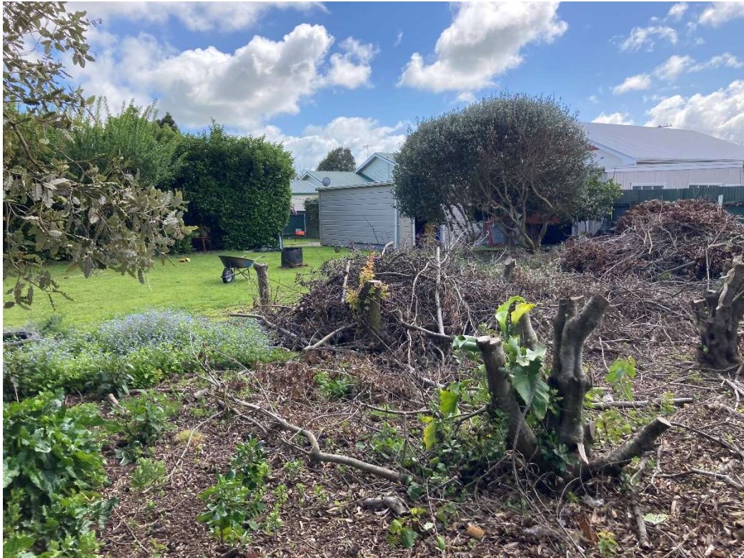
PHOTO 5: Lot 2 looking north west from south east corner, many tree stumps requiring removal.