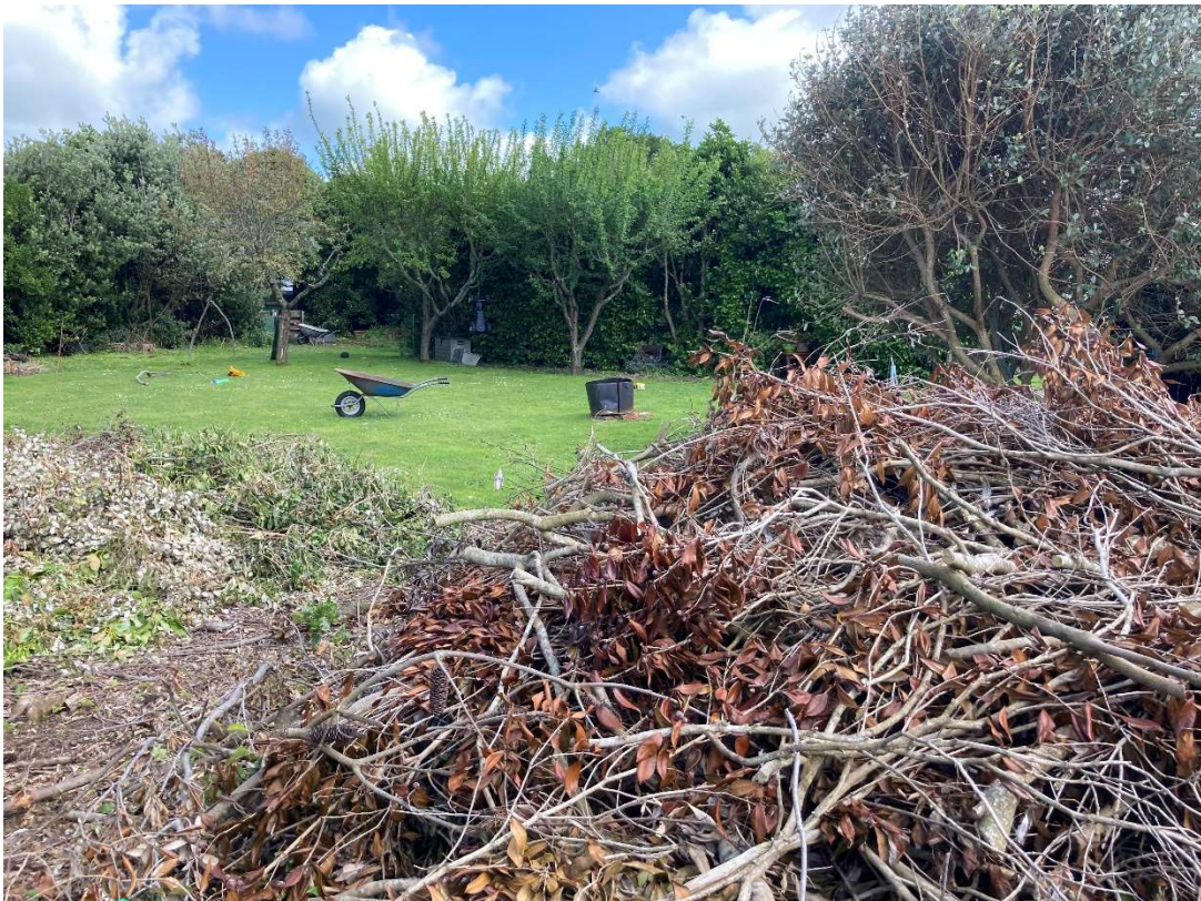
PHOTO 4: Lot 2 looking south west from north east corner, note hedges and trees.