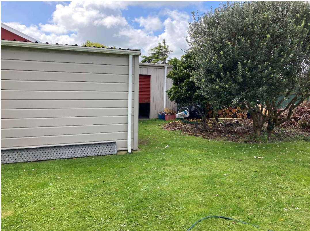
PHOTO 10: Downpipes from Lot 1 building, need to ensure soak holes are not in Lot 2.