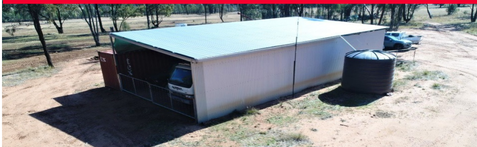
4 BAY SHED