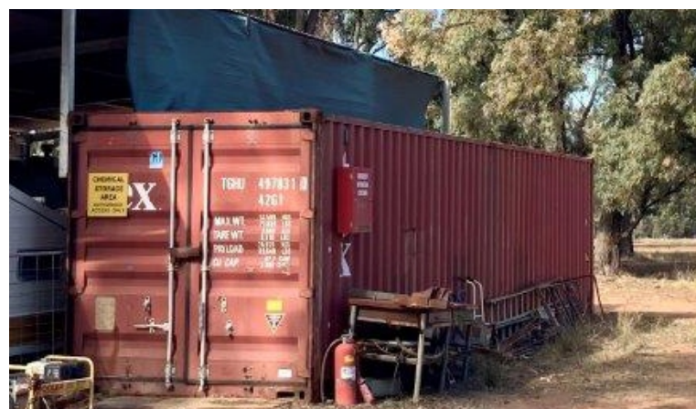
40 FOOT SHIPPING CONTAINER

Redden Family Real Estate recommends you obtain the following: Independent legal advice, Unconditional finance approval, Pest & building inspections