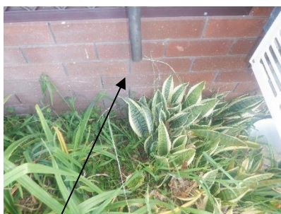
Air condition drip point