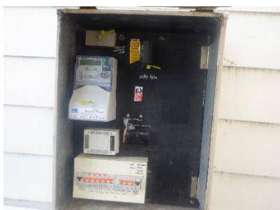
No termite barrier notice