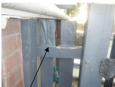
Decay to fence