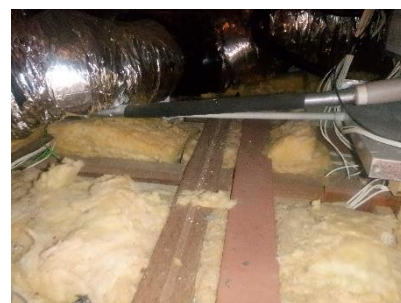
Insulation and ducts obscured timbers