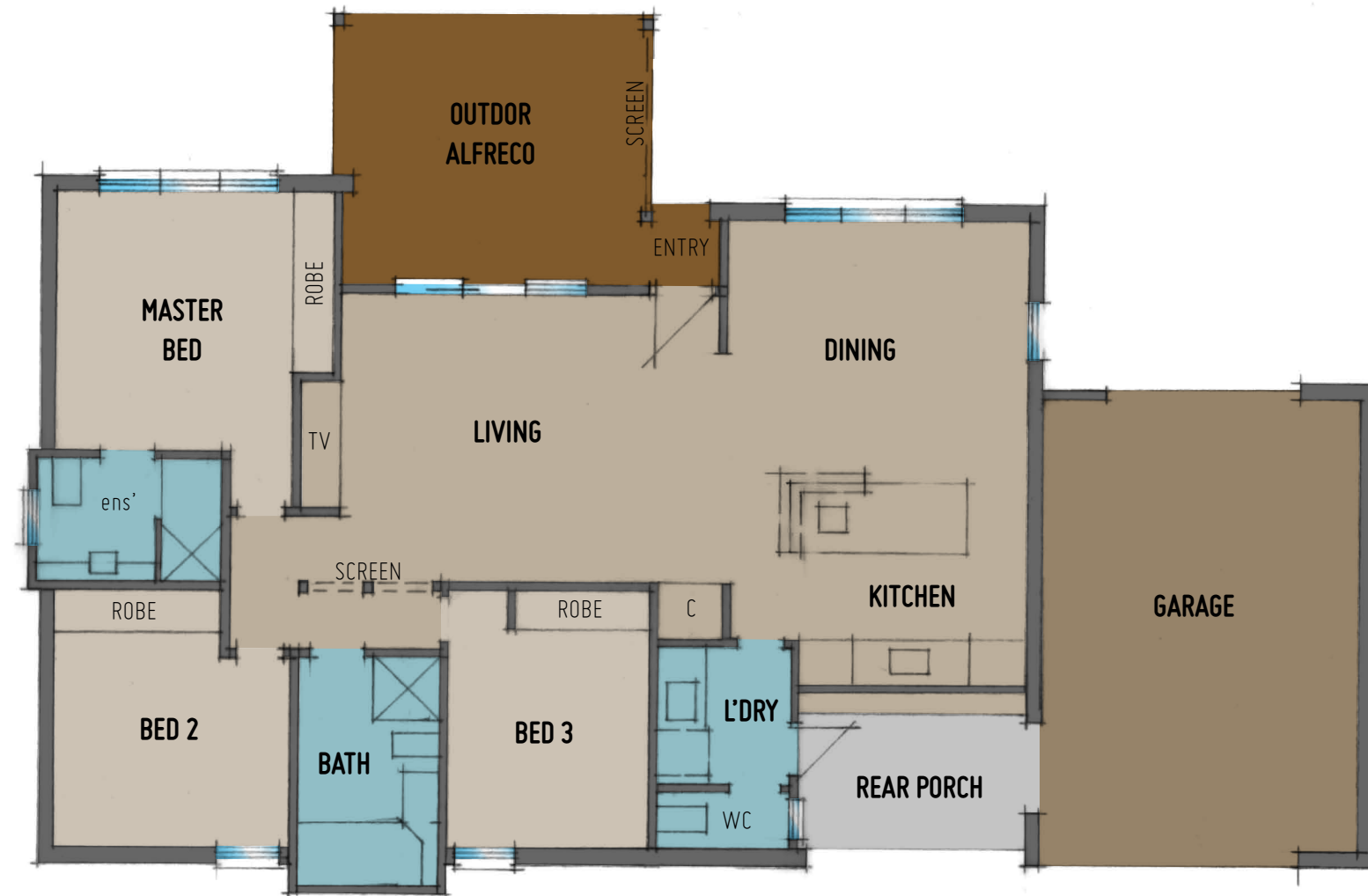
FLOOR PLAN Scale 1cm = 1m @A3 DESIGN CONCEPT FEB 24'