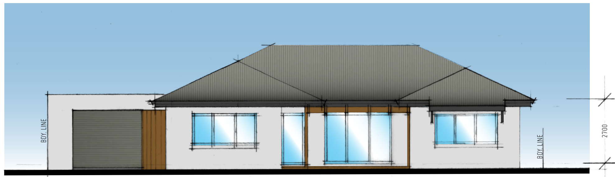
NORTH (STREET) ELEVATION Scale 1cm = 1m @A3 DESIGN CONCEPT FEB 24'