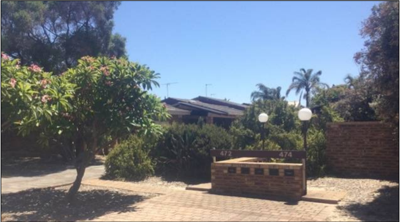
SOUTHGATE, 472 CRAWFORD ROAD, DIANELLA :: SP8223