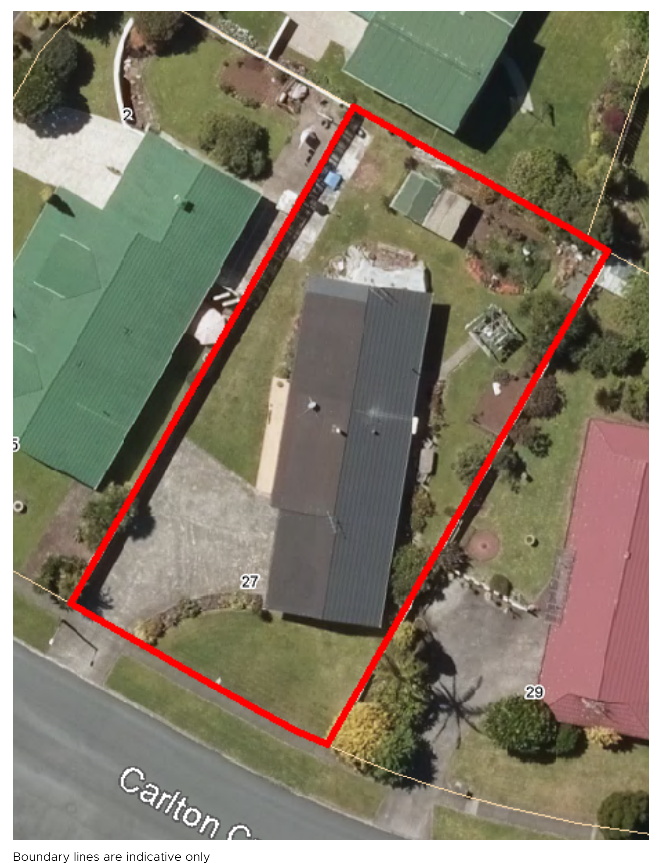
Boundary lines are indicative only