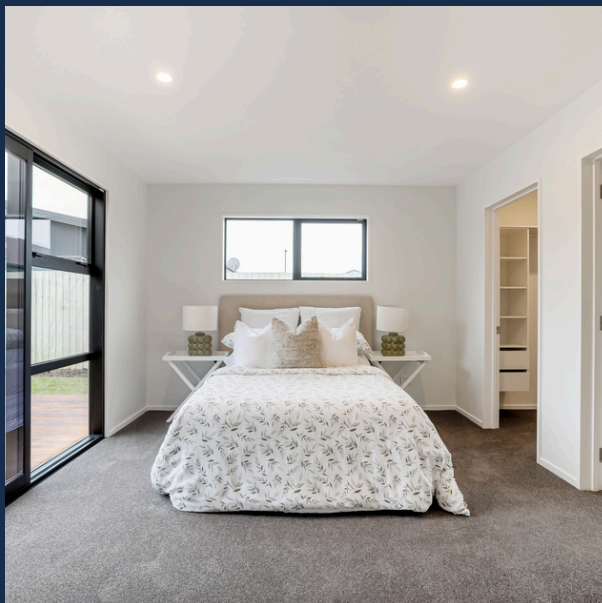
③ Primary bedroom