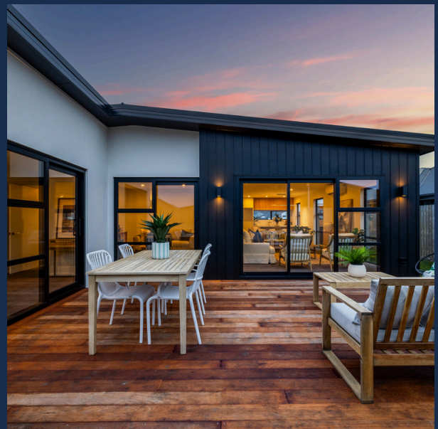
④ Outdoor living