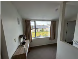
Subject window of re-testing.