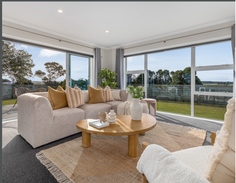
2 Living Area