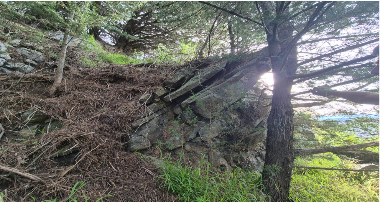
Figure 4: Example of rockfall source noting the jointing and tabular nature of potential rocks