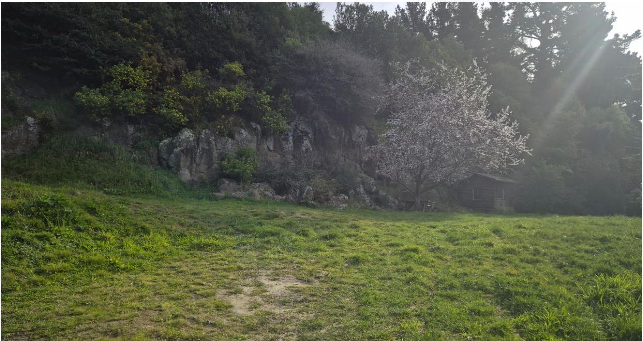
Figure 1: Rock outcropping on upslope side of flatter, benched area

Three rockfall source areas were identified during the site inspection on 17 August 2025. The first consists of near vertical rock outcropping located around 35m upslope (west) of the property at 50mRL elevation. The outcrop is located on the upslope of a near horizontal benched area (<10 degree slope), the benched area is wider than the outcrop is high, and it is assessed any rock that mobilises will come to rest immediately beneath the outcrop. We consider this outcrop does not pose any risk to the dwelling. Refer to Figure 1.