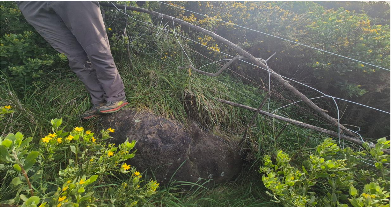
Figure 2: Buried rock outcrop or boulder at 70mRL

The third rockfall source was observed around 135m south-west and upslope of the dwelling at an elevation of 95-100mRL. The outcrop consisted of in-situ rock and boulders located 3-5m downslope of the source. The average boulder size appeared to be around 0.8\text{m}^3 and generally triangular or tabular in shape with the maximum size up to around 1.5\text{m}^3 . This source is considered to be the most likely to potentially pose a risk to the dwelling and has been used for the rockfall hazard assessment. Refer to Figures 3 and 4.