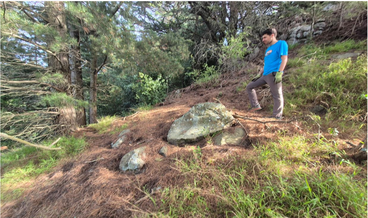
Figure 3: Boulders located downslope of the rock outcrop in top-right corner

The third rockfall source was observed around 135m south-west and upslope of the dwelling at an elevation of 95-100mRL. The outcrop consisted of in-situ rock and boulders located 3-5m downslope of the source. The average boulder size appeared to be around 0.8\text{m}^3 and generally triangular or tabular in shape with the maximum size up to around 1.5\text{m}^3 . This source is considered to be the most likely to potentially pose a risk to the dwelling and has been used for the rockfall hazard assessment. Refer to Figures 3 and 4.