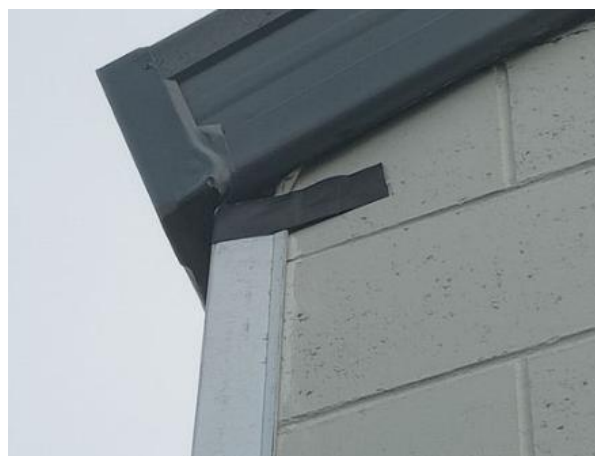
Corner flashing between the block and weatherboard cladding is secured with tape