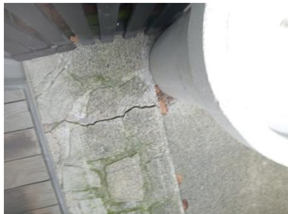
Crack in the concrete step in the east corner of the property