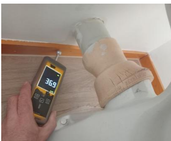
Deteriorating toilet connector