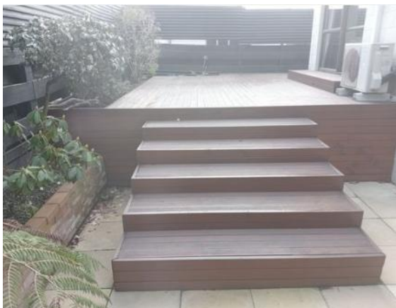
Deck - without a balustrade