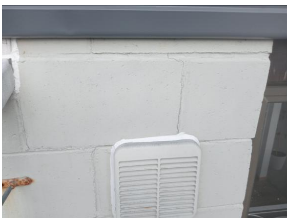
Minor cracking to blocks