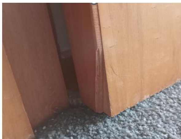
Chip in the bottom corner of the bedroom door