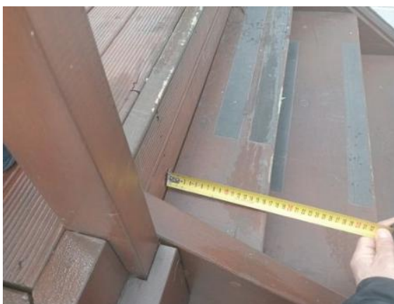
Top step is too shallow