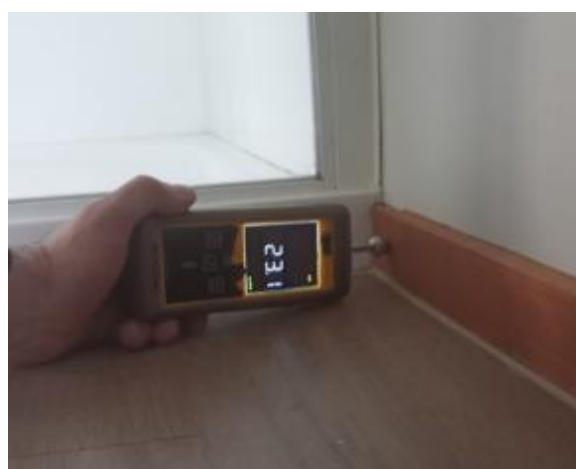
Moisture testing in the house – dry range