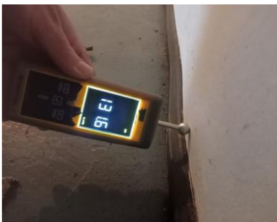
Damaged skirting in the garage – wet moisture readings