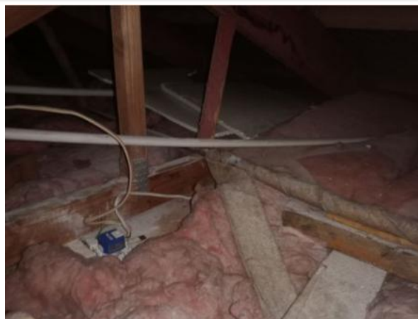
Roof space – insulation. PVC pipes