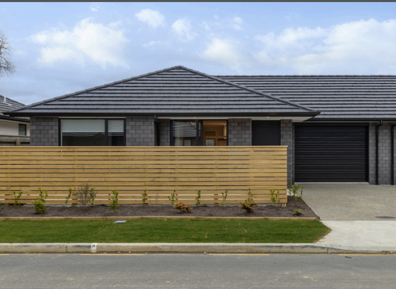
1 5 Catherine Lane