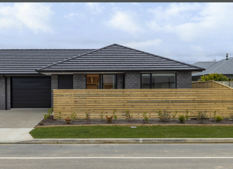
3 7 Catherine Lane