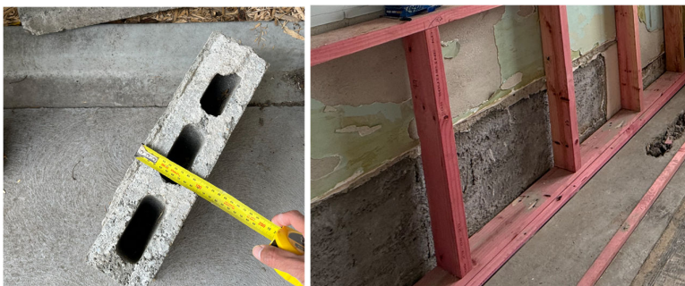
Figure 2: Concrete block used in walls (left), Eastern internal bathroom wall during recent refurbishment (right)

The building is a single storey heavy unreinforced masonry structure, built circa 1950's. The exterior walls are plastered over double layer concrete block with cavity, and the internal partitions are rendered single layer concrete block. The concrete blocks used are 400x200x100 thick, as shown in the photo below. They are understood to be not reinforced or grout filled. However, we believe that there is a reinforced concrete bond beam on top of all walls. The building has a flat roof of butanol glued over timber substrate, supported by timber joists. The ground floor is concrete slab on grade. It is understood to have a perimeter ring beam and possible internal thickenings to support the heavy masonry walls.