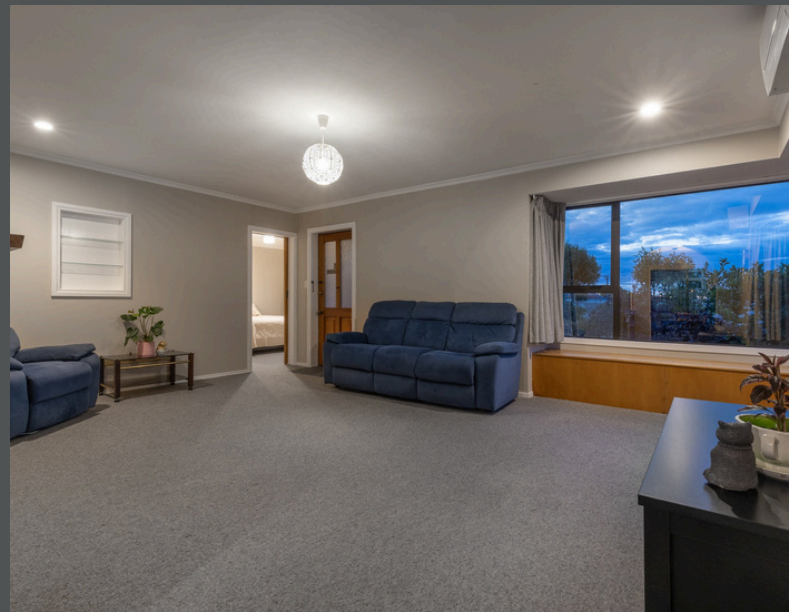
2 Living Area