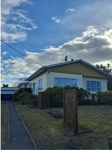
Photo of front of house