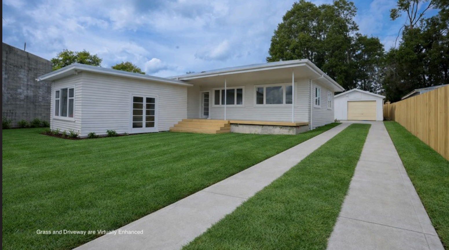
Grass and Driveway are Virtually Enhanced