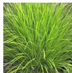
Lomandra "Lime Tuff"