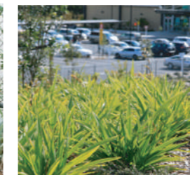
Phormium "Emerald Gem"