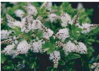
Hebe Wiri Mist