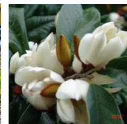
Michelia "Lemon Fragrance"

Selected stone chip with timber batten edging