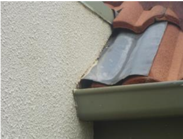
Sloping roof area/rear of dwelling