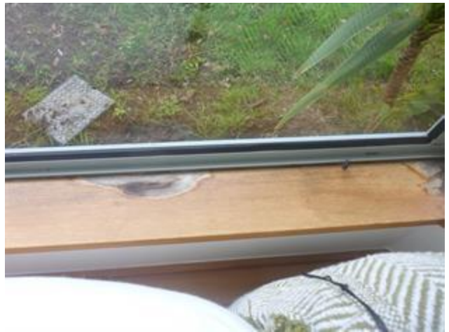
Moisture / UV damage