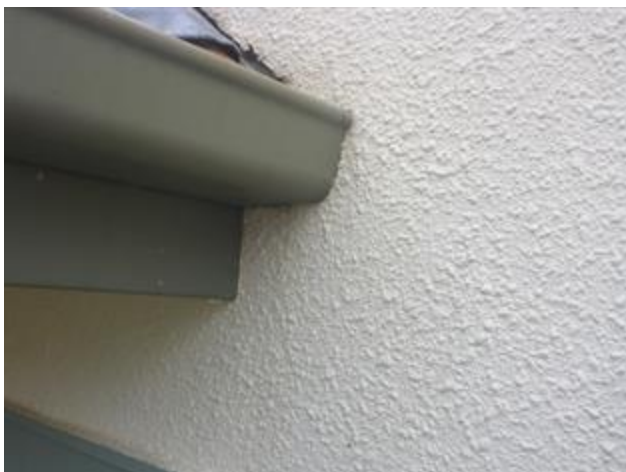
Areas of embedded fascia/further appraisal recommended