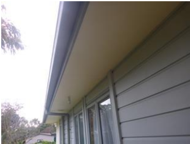
Cement board soffit

Dirt/ grime buildup can shorten the life of the cladding material. As part of the maintenance schedule, I recommend carefully washing down sealed cladding, windows and frames regularly. Particular attention should be paid to the areas that do not get rain washed, such as under the eaves. A soft brush and a low-pressure hose is recommended and not a high-pressure water blaster.