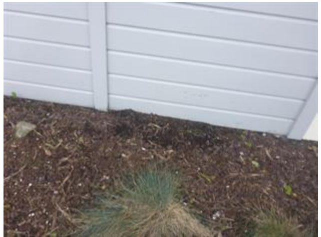
Cladding in contact to the front