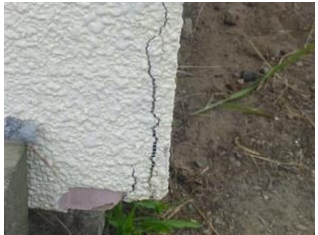
Impact damage side of dwelling