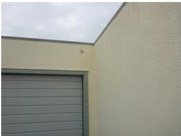
Top of door

My recommendation is that the monolithic cladding now have further specialist appraisal for a more invasive investigation of the cracks and for the correct repair requirements.