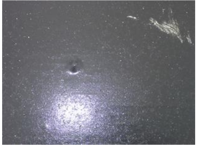
Substrate fastener penetration