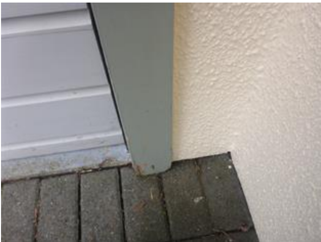
Cladding in close to contact