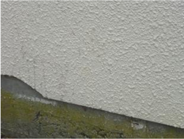
Impact damage rear of dwelling