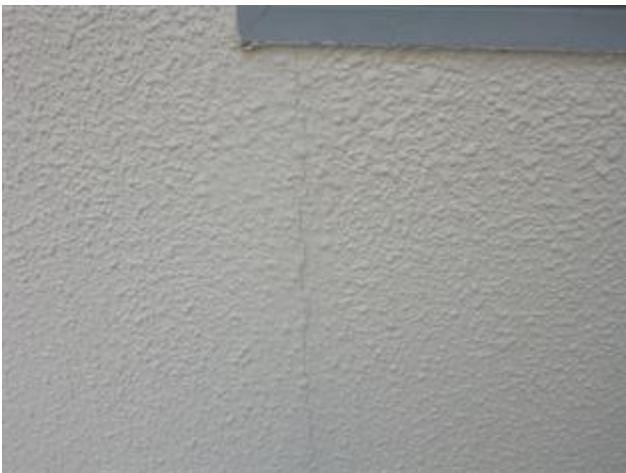
Rear of dwelling beneath