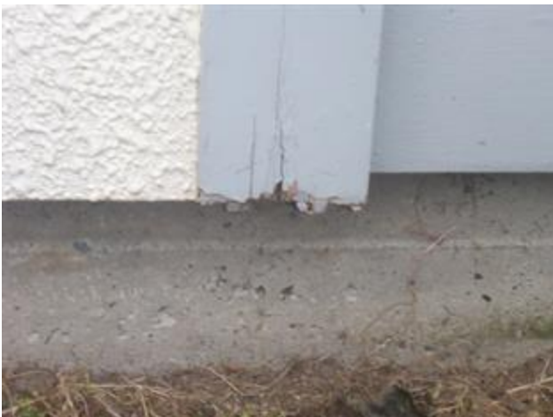
Batten end-grain decay