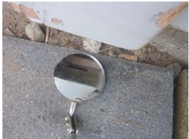
No paint seal