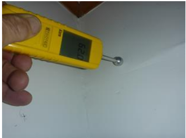
Moisture levels /acceptable behind the crack