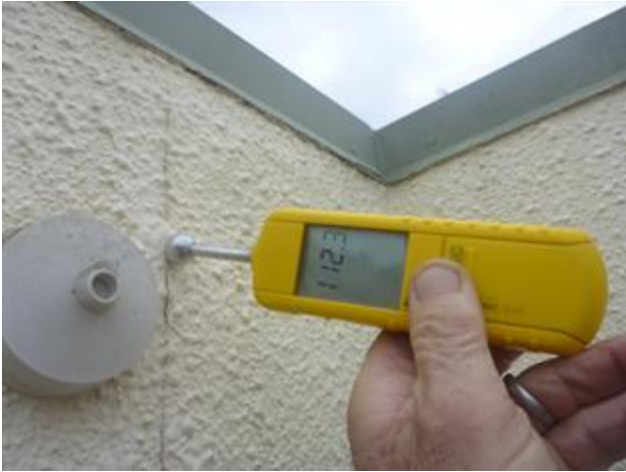
High moisture levels recorded to the cladding crack /front of the garage