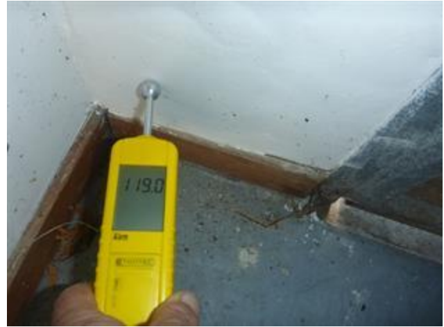
High moisture levels recorded ground level