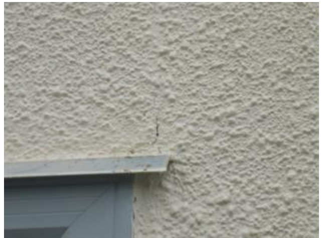
Rear garage door