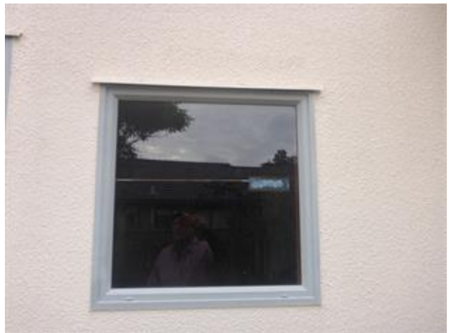
No soffit/metal cap flashed