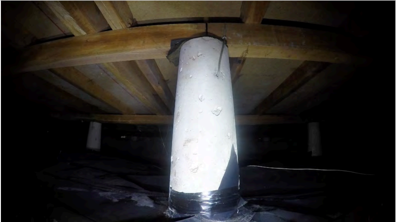
20: Pile with bearer join. The bearer join has pulled apart. This is most likely caused by timber shrinkage. The subfloors were generally constructed from wet timber, which reduces in size when dry.