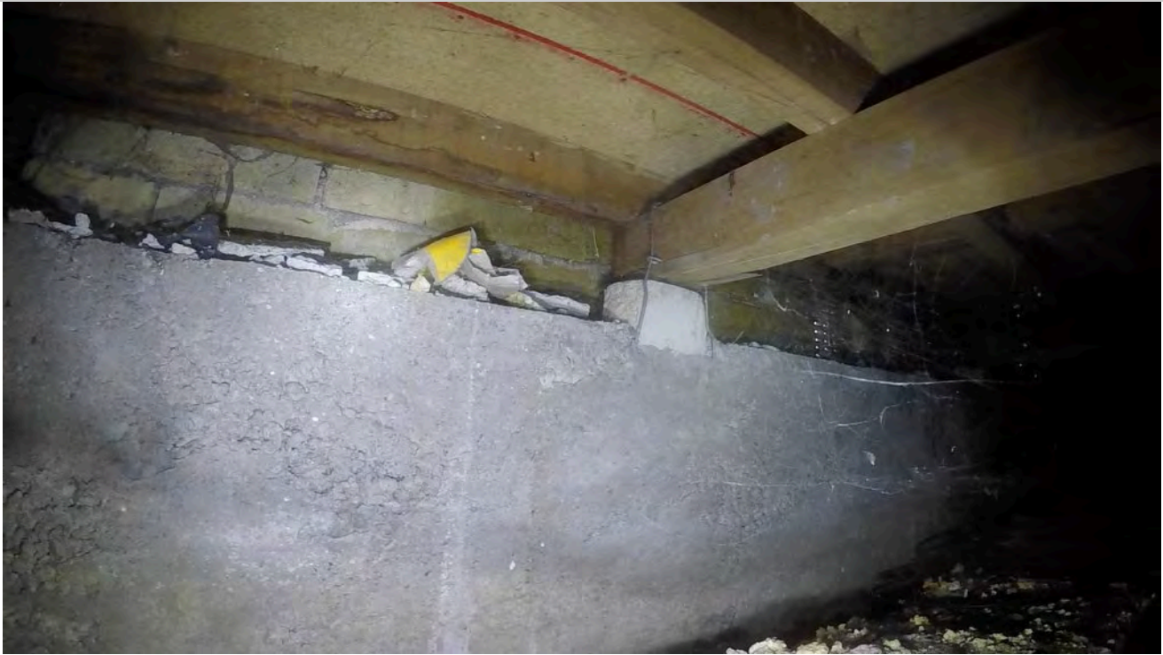
26: View of bearer meeting ring foundation with connection.