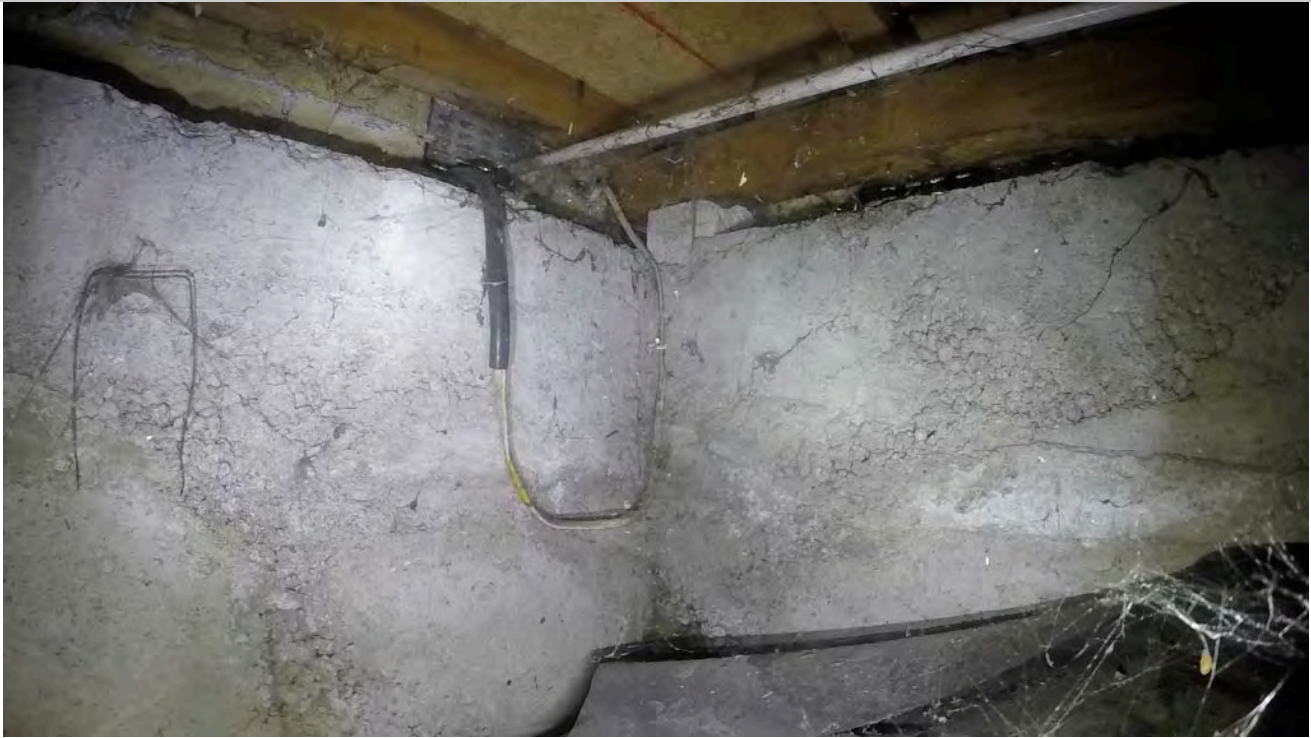
44: View of ring foundation with services. The joist has been notched by at least 40mm. There is evidence that the wastewater is flowing back into the foundation from the gully.