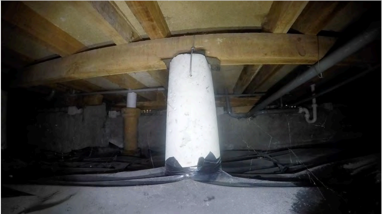
38: There are indications of an above floor water leak here and the timber is showing signs of water damage.