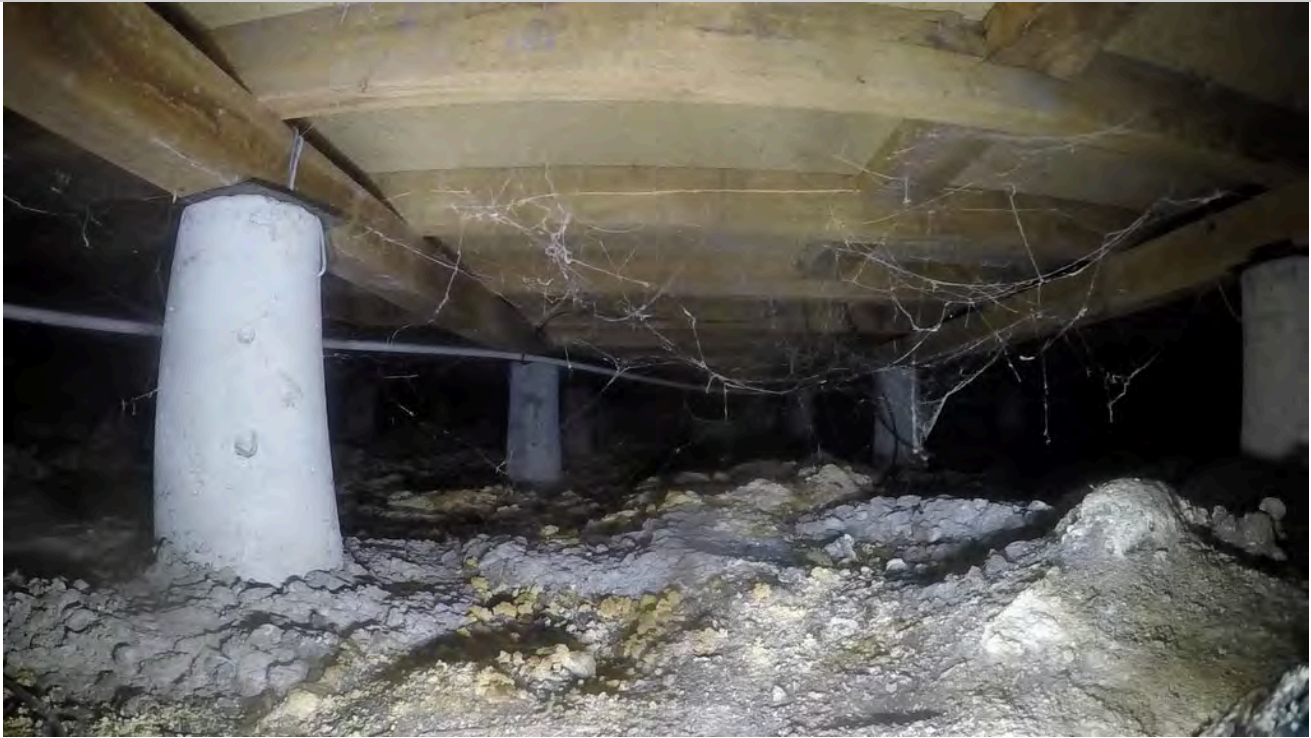
28: Pile with bearer join. There is significant yellow mold growing beneath this home.