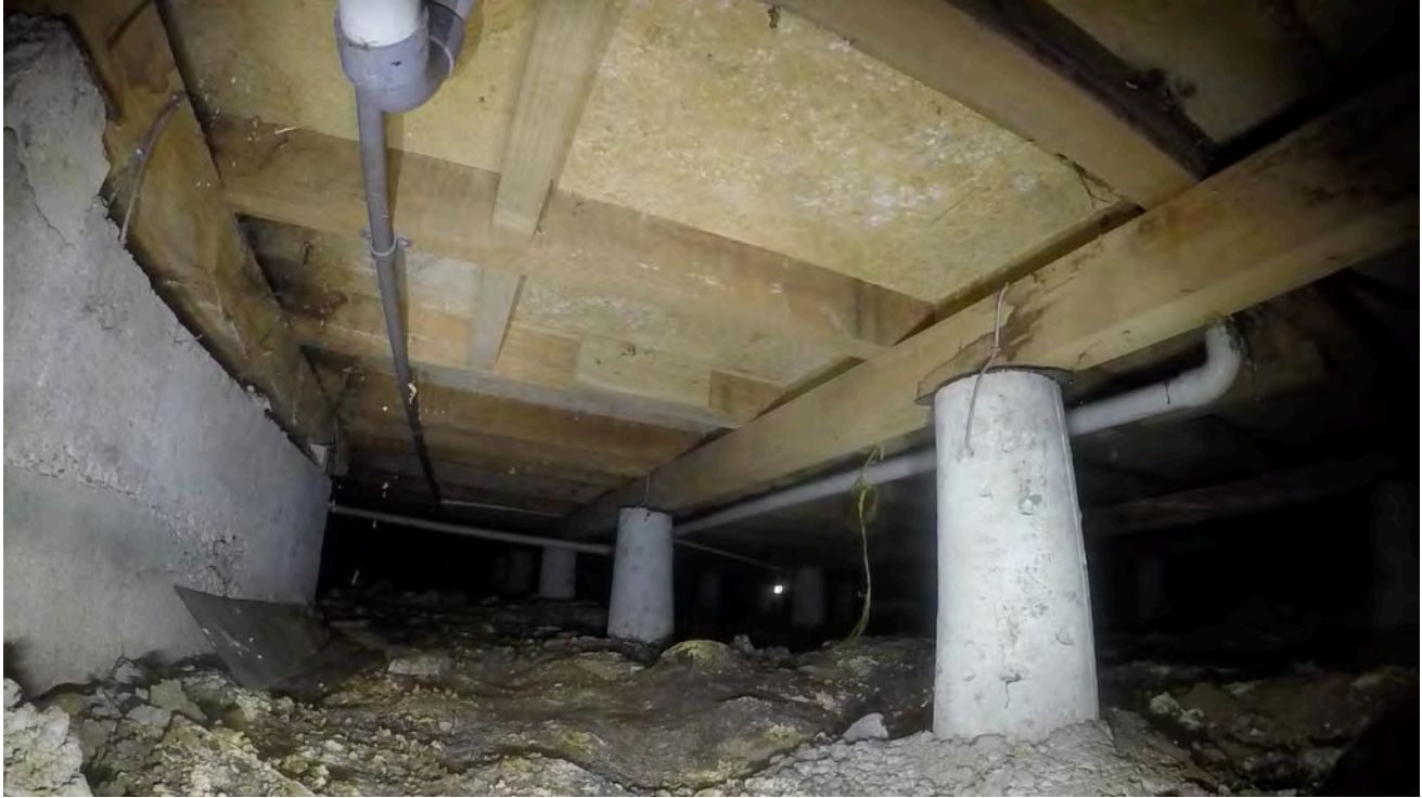
6: The home has outside bearers supported on concrete blocks embedded into the foundation and connected with stapled off wire. The outside bearers show signs of water damage in several areas along the foundations.