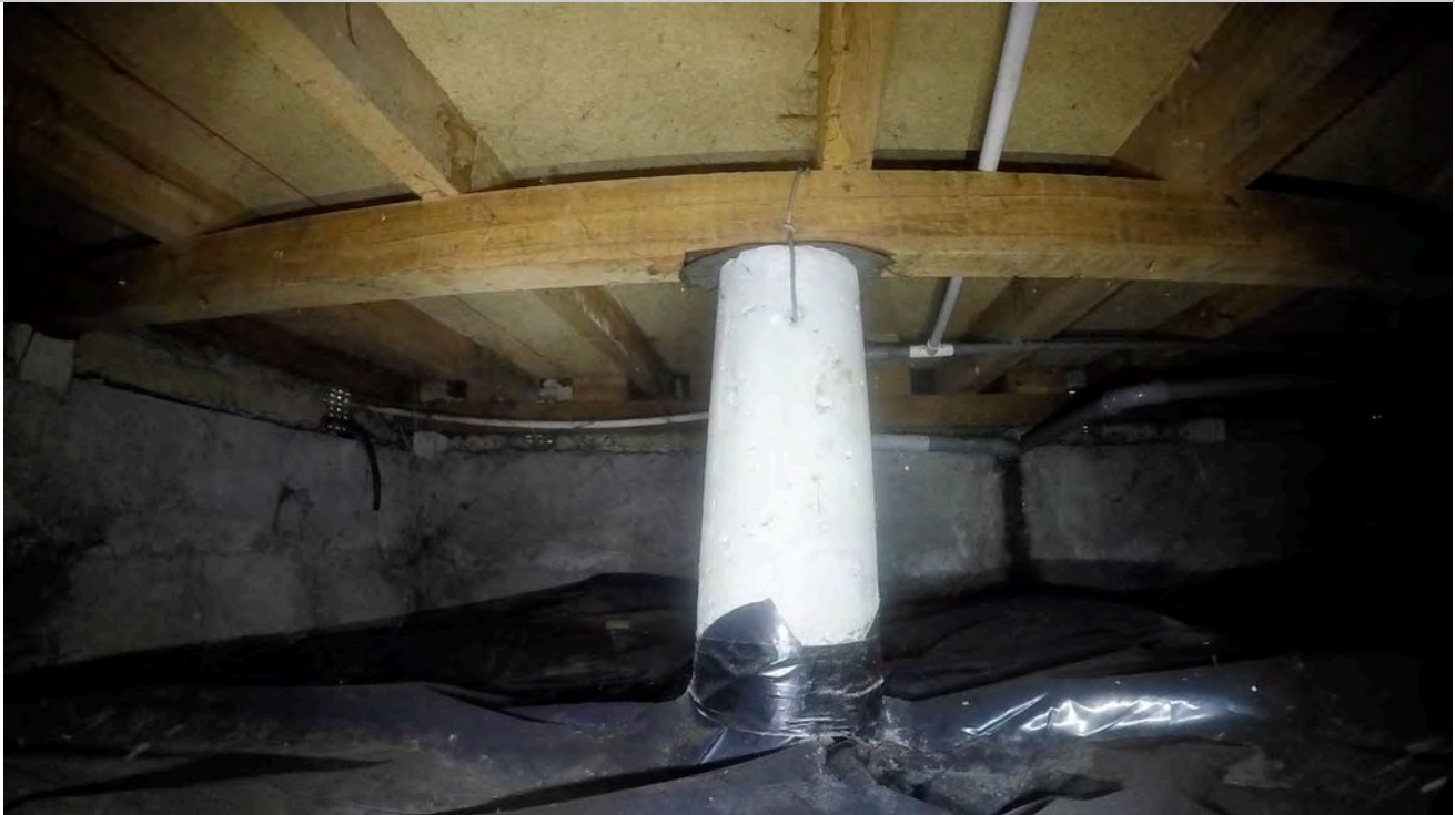
42: View of bearer meeting ring foundation with connection.