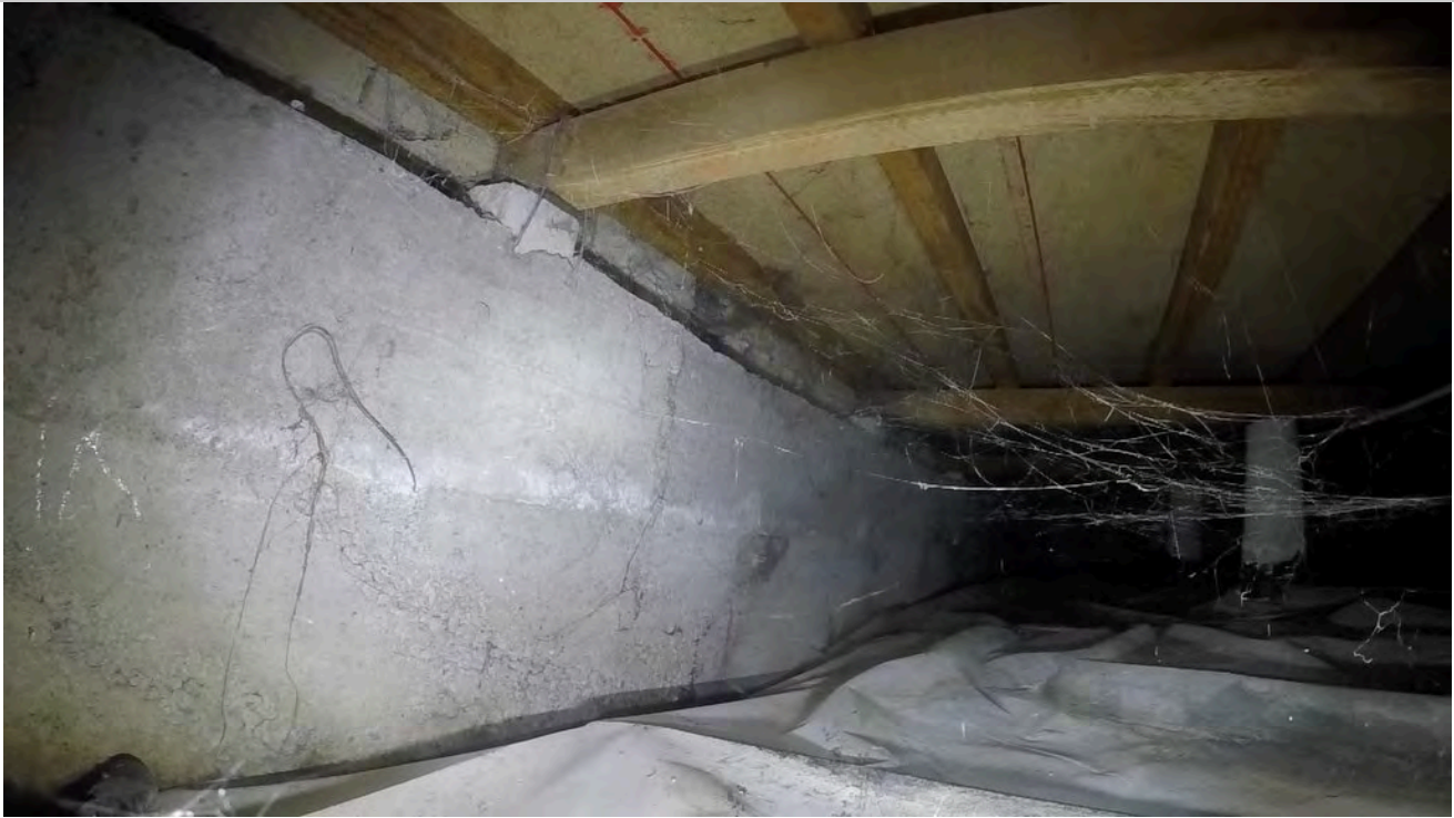
8: All piles appear to have their original connections, however there are several piles that the stapling has not been carried out correctly.