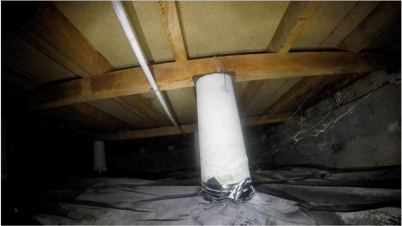
24: View of bearer meeting ring foundation with connection.