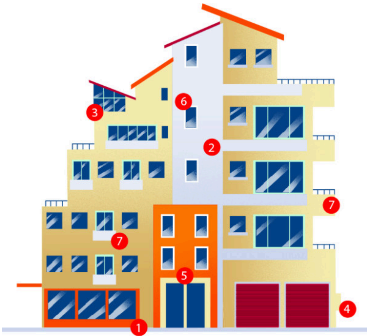
Leaky apartment risks