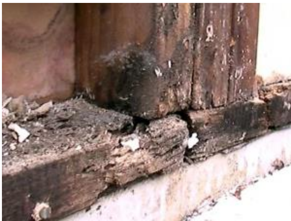
Typical rot seen in the bottom plate of a house built with untreated timber and no cavity