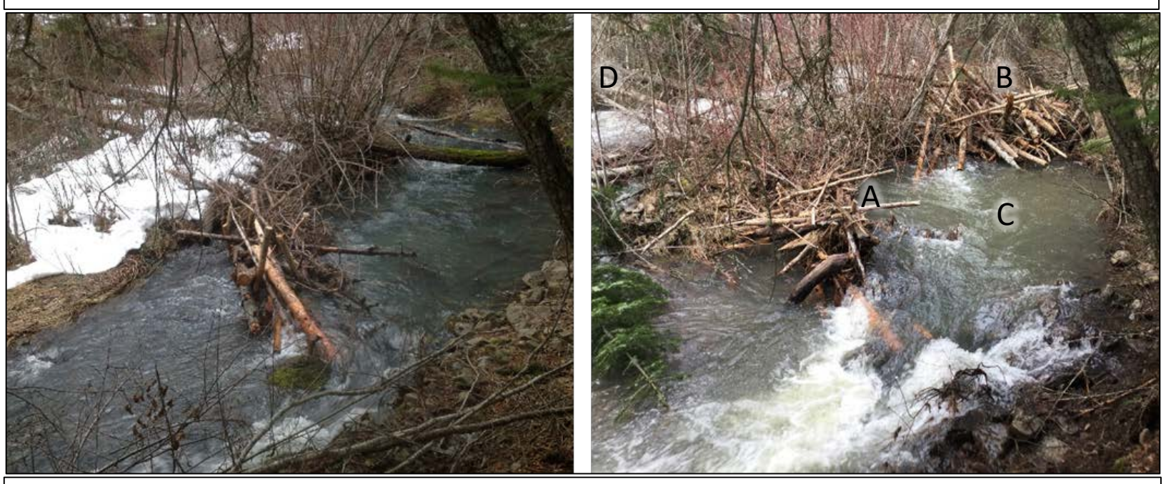
Figure 1 . Pre (Feb. 2017; left photo) and post (March 2017; right photo) high flow images of PALS 48. In the post high flow photo, note A) debris accumulation on the original PALS, B) debris from failed upstream PALS on the upstream large wood spanner, C) pool formed upstream of structure/downstream of debris jam, and D) activated side channel in the far background.

Results: During the high flows of winter 2017, several structures were lost, primarily in the lower treatment section. The majority of LWD from these structures accumulated on downstream structures or on LWD spanners creating complex debris jams. Structures that resisted the high flows show evidence of bed aggradation upstream of structures, LWD accumulation on structures, and pool forming scour downstream of structures creating more of a step-pool character compared to the plane-bed character the channel exhibited prior to PALS installation.