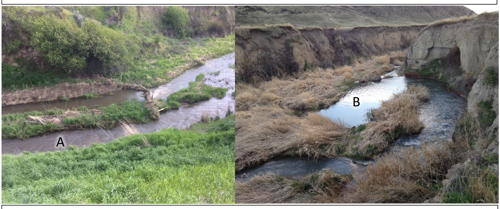
Figure 1 . Two BDA structures on Pataha Creek during receding high flows. Note A) activated side channel and B) ponding upstream of BDA. Areas such as these were heavily planted with willow and cottonwood whips and poles to take advantage of increased water retention and fresh fine sediment deposits.

Results: During the high flows of winter 2017, several structures were lost, primarily in the lower treatment section. The majority of LWD from these structures accumulated on downstream structures or on LWD spanners creating complex debris jams. Structures that resisted the high flows show evidence of bed aggradation upstream of structures, LWD accumulation on structures, and pool forming scour downstream of structures creating more of a step-pool character compared to the plane-bed character the channel exhibited prior to PALS installation.