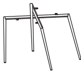
B (1 pc)