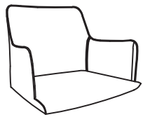
A (1 pc)