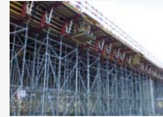
Multiform system for civil works