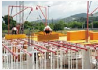
Mecanoconcept Slab formwork