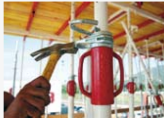
Post-shores and shoring systems