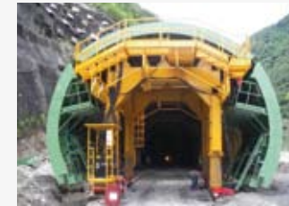
Ports, mine tunnels and advance carriages