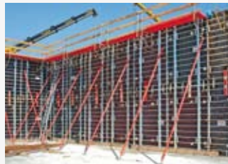
Alisply Wall Solutions