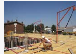
Accesses and safety