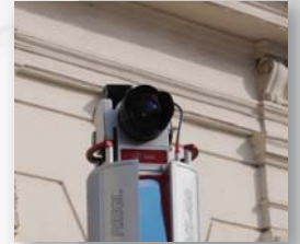
NIKON® DSLR camera for mobile and terrestrial applications