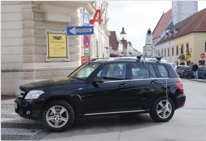
GIS-Applications and Asset-Management