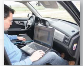
system operation with a single laptop

Seamless RIEGL workflow for MLS data acquisition, processing and adjustment is provided by RIEGL's proven software suite.