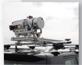
horizontal setup for, e.g. road surface scans