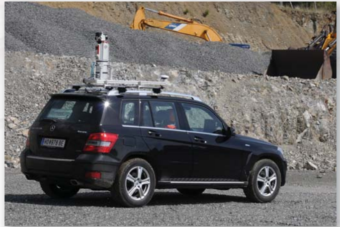
Measurement of Bulk Material, Surveying in Open-Pit Mining