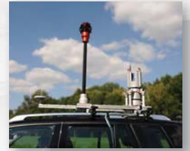
vertical scanner setup with additional panoramic camera system