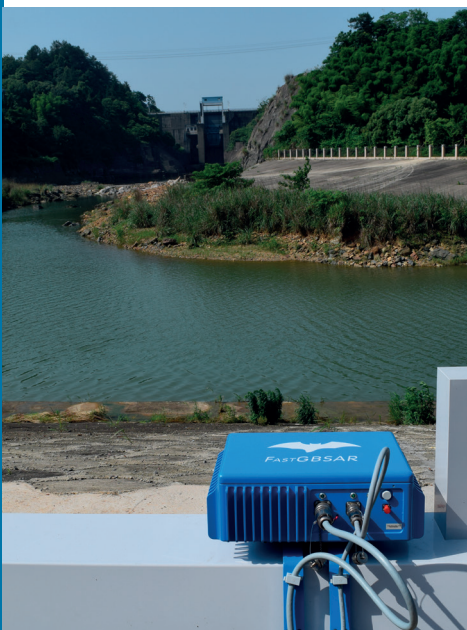
Three gorges Test dam, China

The FastGBSAR-R operates in Real Aperture Radar (RAR) mode for remote static and dynamic structural health monitoring of man-made structures. Easily transportable, the FastGBSAR-R can quickly be installed on a tripod. In a few minutes the user can obtain displacement profiles along the complete structure with an accuracy of 0.01 mm.