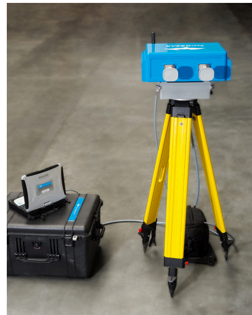
FastGBSAR-R installed on a tripod

(1) Range resolution depends on the frequency bandwidth allowed by local authorities, which is generally limited to 200 MHz, leading to a range resolution of 0.75 m.