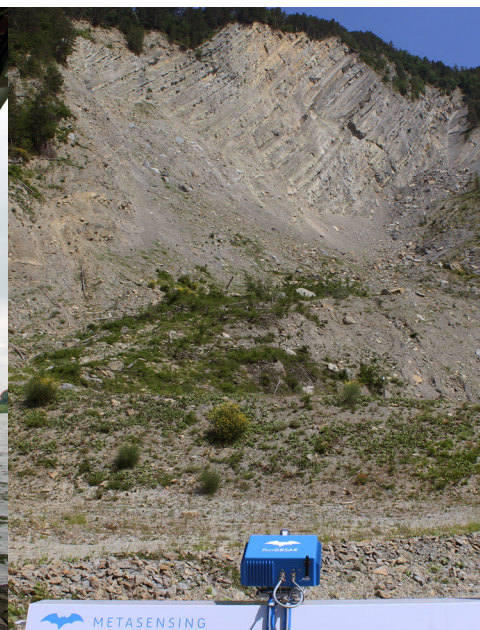
Comiolo Landslide, Italy