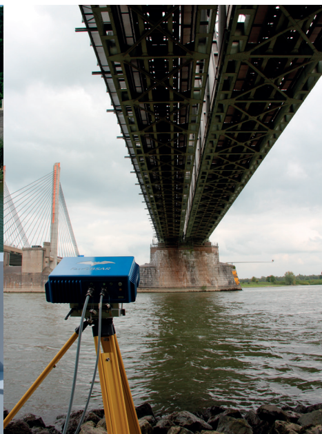
Martinus Nijhof Bridge, the Netherlands