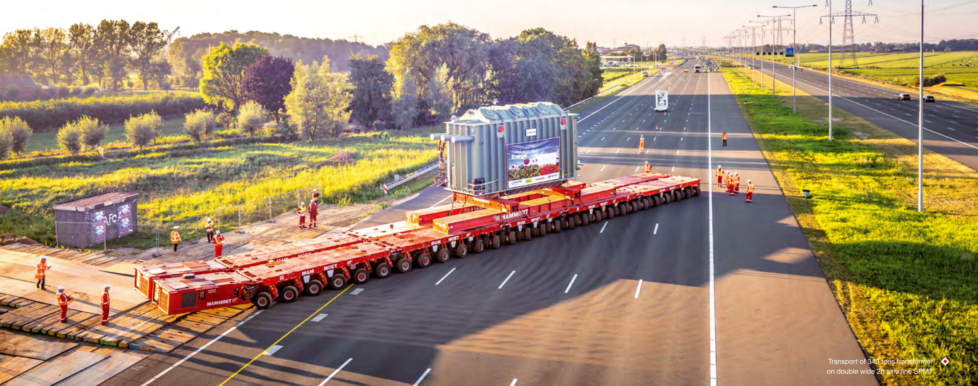
Transport of 340 tons transformer on double wide 28 axle line SPMT

Across industries, there is a continuous quest for greater efficiency and, hence, economies of scale. This has resulted in a steady increase in the height, size and weight of modules, components and structures.