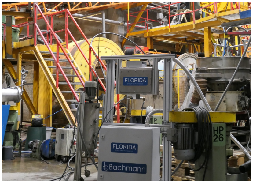
Figure 3: FLORIDA installed in flotation plant