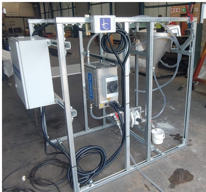
Figure 1: FLORIDA installed at Scanmin 's factory

All the items apart from the measurement chamber are standard J&C Bachmann supply. The measurement chamber was especially developed for the low volume of material that will be tested in such a test rig. Furthermore, it contains a thin window; this window was selected on its ability to provide maximum XRF