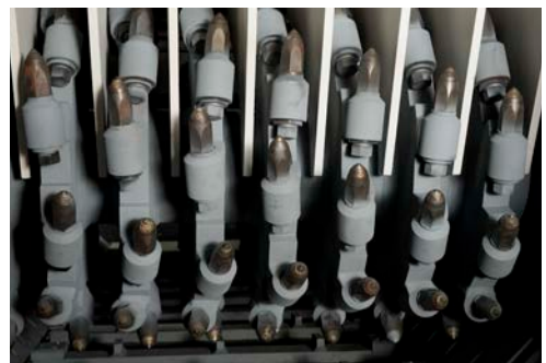
Tight Pick Pattern

Behind every well-built McLanahan Feeder-Breaker is a team to help you keep your unit in optimum running condition to maximize your return on investment. McLanahan's experienced Field Service Department will ensure that your unit is up and running as quickly as possible after installation and normal maintenance periods. Years down the road, McLanahan's Parts Department will be available with expert assistance and advice on maintaining the unit to perform at its best.