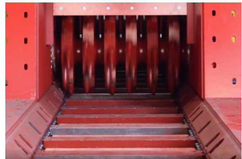
Chain Conveyor and Breaker