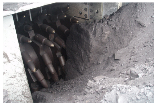
Coal being crushed using a Feeder-Breaker