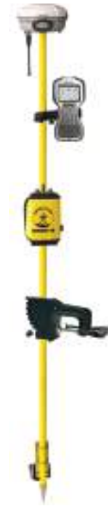
Hydrolite-TM™ with Trimble GPS and data collector