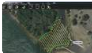
Mission Planner application installed on a laptop showing preplanned survey