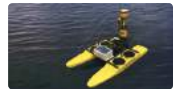
HyDrone™ ASV with Trimble SPS 585 and TSC3