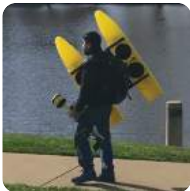
Lightweight and portable

Remote control of the survey boat is easy using a long range remote control unit (RCU) that offers up to 2km range, with a survey endurance of over 8 hours at a survey speed of 3 knots on a single battery bank.