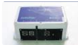
AutoNav™ Control System