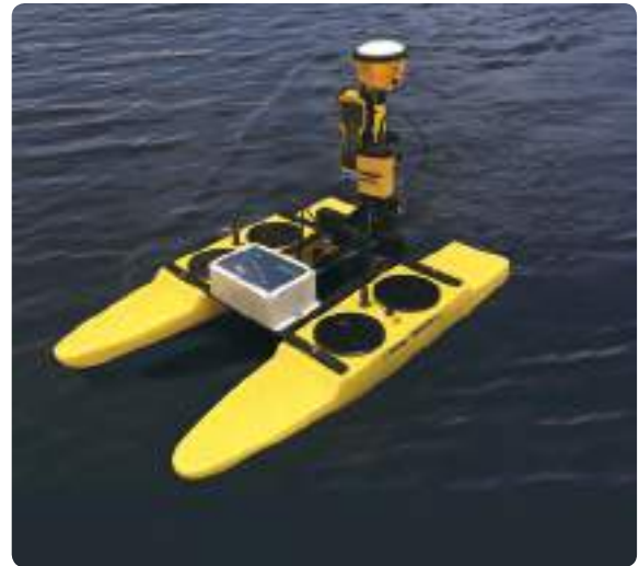
HyDrone™ ASV with HydroLite echosounder, Trimble antenna and Trimble data collector