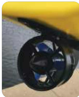
Powerful differential thrusters for maneuverability

With our AutoNav option, the HyDrone™ is also semi autonomous: the vehicle can be monitored while under way, in both Auto and Manual modes.