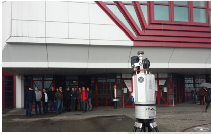
scanning in the rain

Using deviation and reflectance filters, range measurements caused by rain drops and haze can be identified, selected, or deleted, resulting in a clear and clean point cloud of the relevant scene.