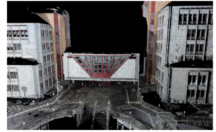
automatically cleaned-up point cloud