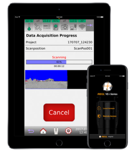
RIEGL VZ-i Series App