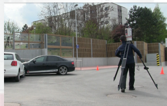
move the scanner to the next scan position