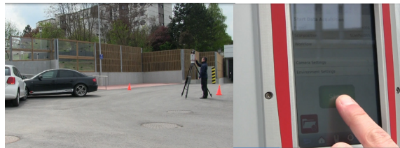
to start the next scan just press the START-button