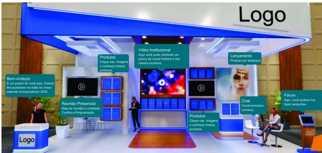
Gold category booth model.

The organization has virtual booths in some categories, which include technological resources to facilitate online interaction with the public.